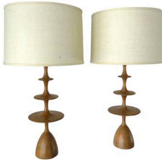
Metro lamp, 2014, offered by Christopher Anthony Ltd.

"These are offered by one of our favorite dealers in Palm Springs. We've bought these lamps for clients."