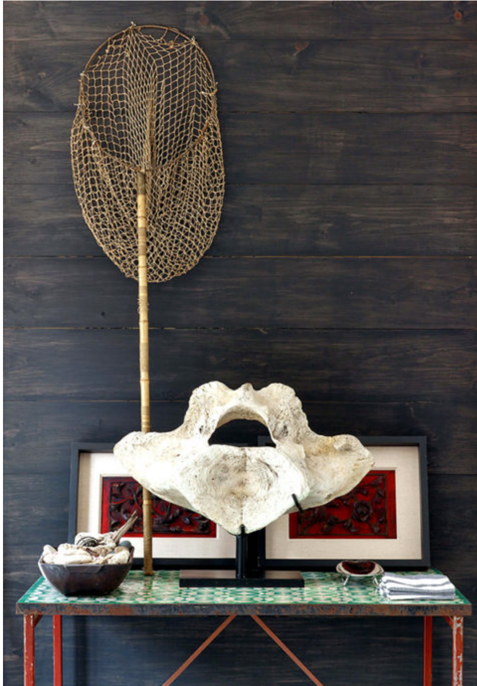
A vintage Moroccan table is topped with a whale bone and a fishing net, references to the area’s past.

Meanwhile, Zeff is working on major hotel projects around the world, including a new Hilton boutique chain with a local-artisanal slant, called Canopy. There’s also a high-end resort in the Cayman Islands for Kimpton and a sustainable hotel in Amsterdam.