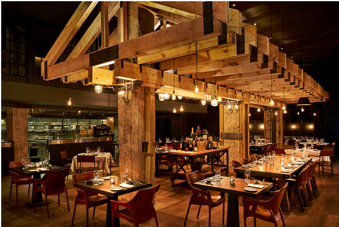
In the main dining room, an antique wine table in the center of the space is from the BLACKBARN shop.

Their house may be off the beaten Hamptons’ path, but the Zeffs are hardly hiding out. Since it’s the BLACKBARN model home, the couple welcomes prospective clients to tour the property and soak up the Zeff lifestyle — a breezy, casual take on the good life. “People come in and think it’s staged, but it’s not. They say, ‘Where did you find this?’ My wife and I love that. We love to find things,” he says. Their house is filled, but not cluttered, with a good mix of eye-catching objects, from vintage water skis to tidy stacks of National Geographic magazines arranged like bright yellow minimalist sculptures on the bookshelf . In the living room, a pair of black Saarinen Womb chairs sits atop a woven Moroccan rug dyed hot pink.