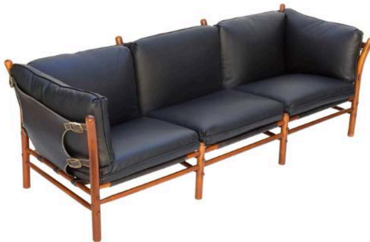
Arne Norell Ilona sofa, 1960s, offered by a la Mod

"These are offered by one of our favorite dealers in Palm Springs. We've bought these lamps for clients."