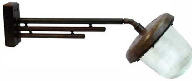
Industrial wall light, mid-20th century, offered by 360volt

"We've used lights from 360volt in all of our Hampton's projects and in BLACKBARN restaurant. We've also visited them in Amsterdam. Love, love, love this vendor."