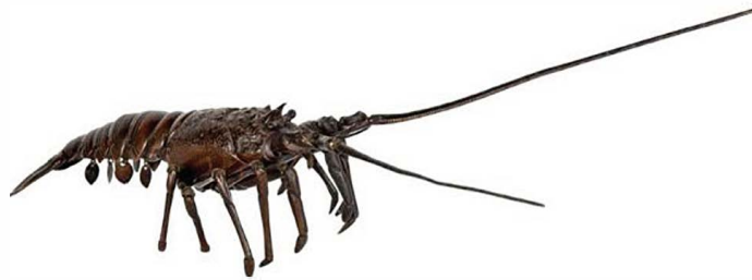
Jizai articulated bronze sculpture, 1880, offered by Galerie Tiago

"We've used lights from 360volt in all of our Hampton's projects and in BLACKBARN restaurant. We've also visited them in Amsterdam. Love, love, love this vendor."