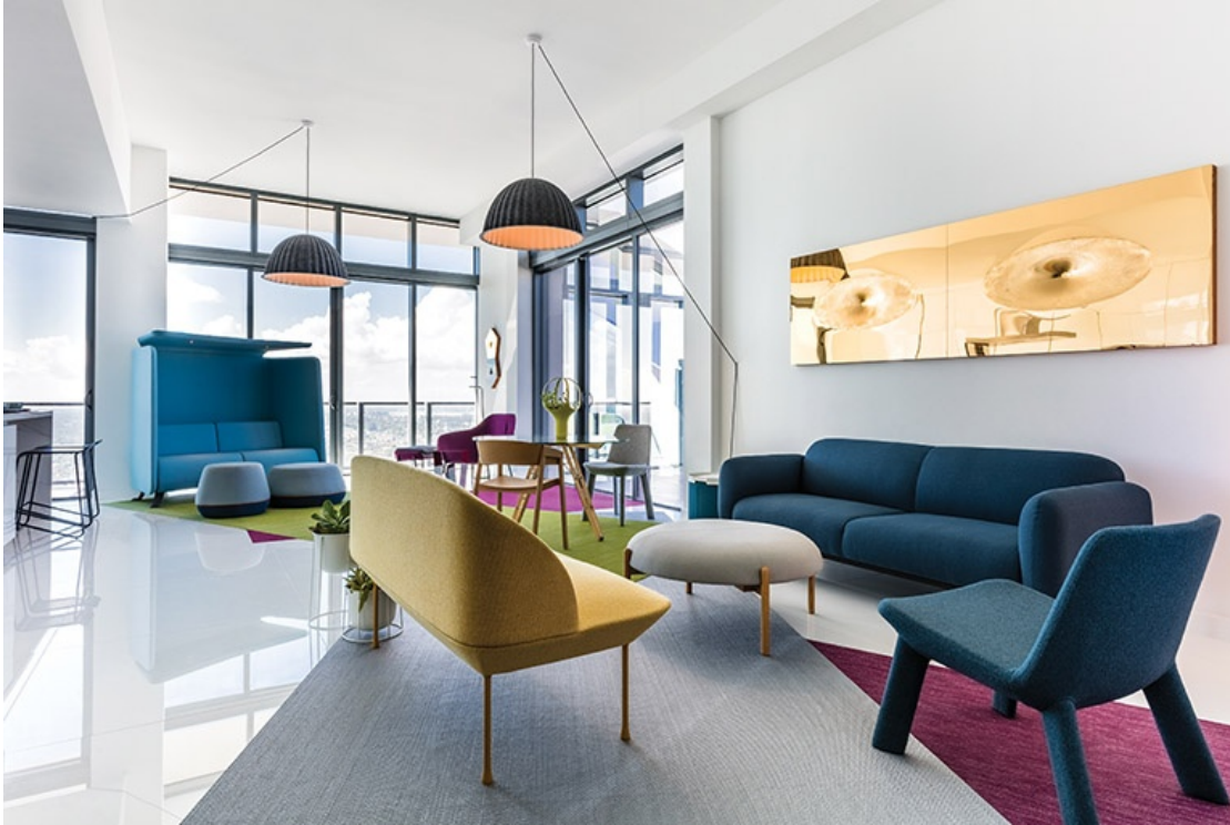
Cable Design's penthouse for CASACOR Miami at Brickell City Centre, Dec. 1-18.