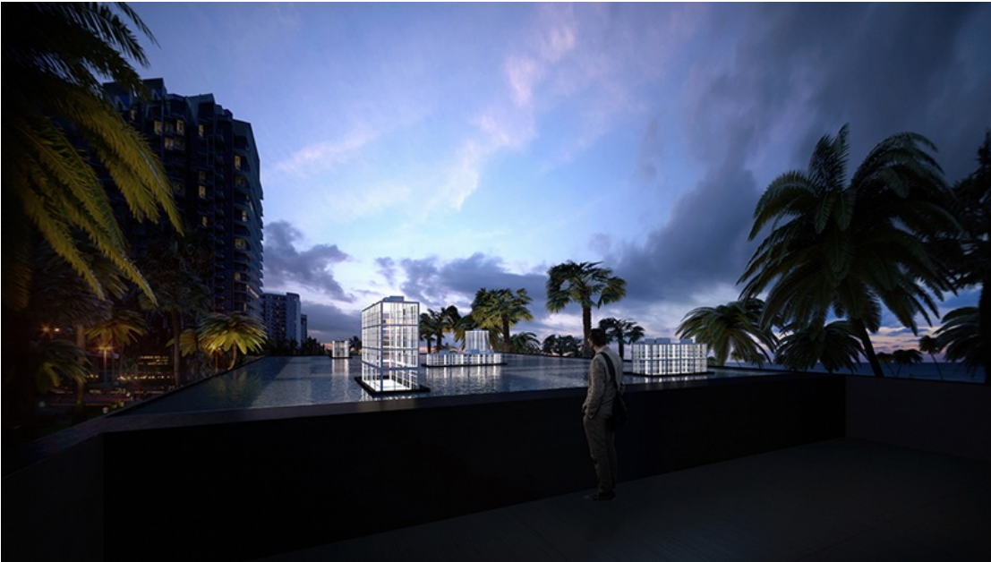
A rendering of "Slow-Moving Luminaries" by Lars Jan , unveiling Dec. 6 at Oceanfront Miami Beach Drive.