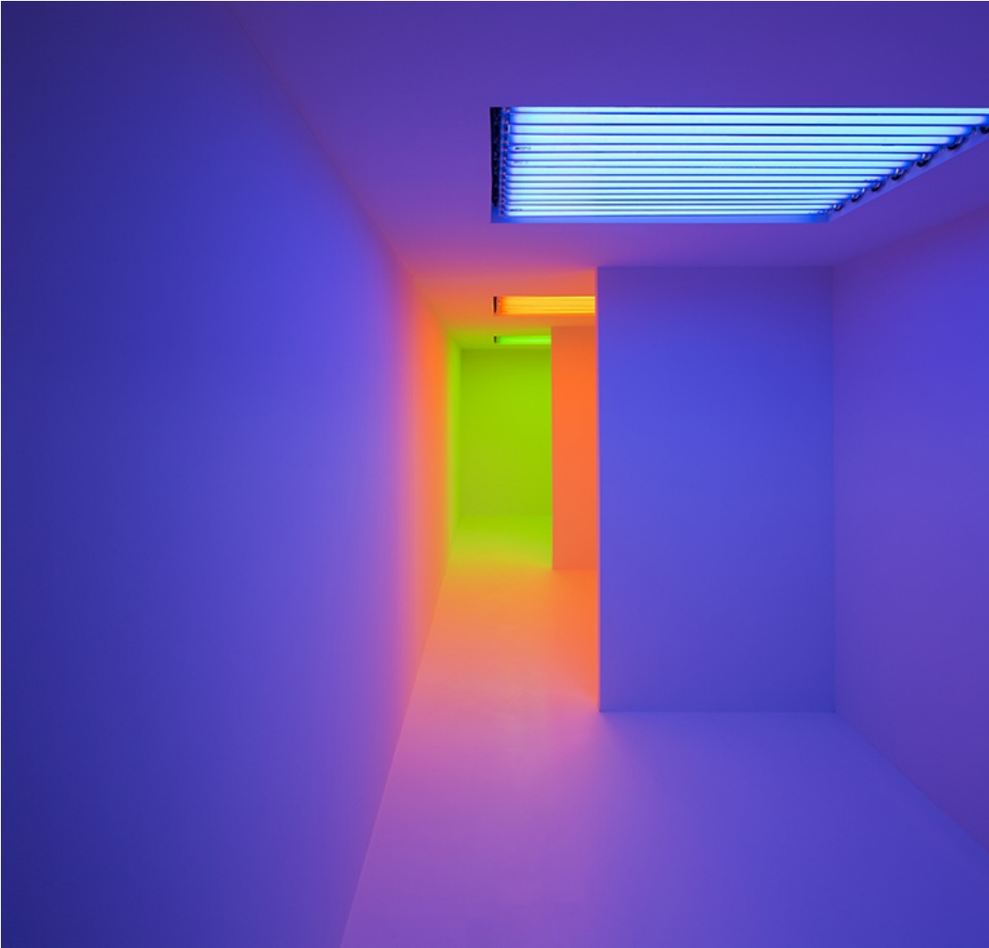
“Chroma,” a mobile museum by Venezuelan artist Carlos Cruz-Diez presented by SCAD , at Untitled , Miami Beach, Dec. 6-10.