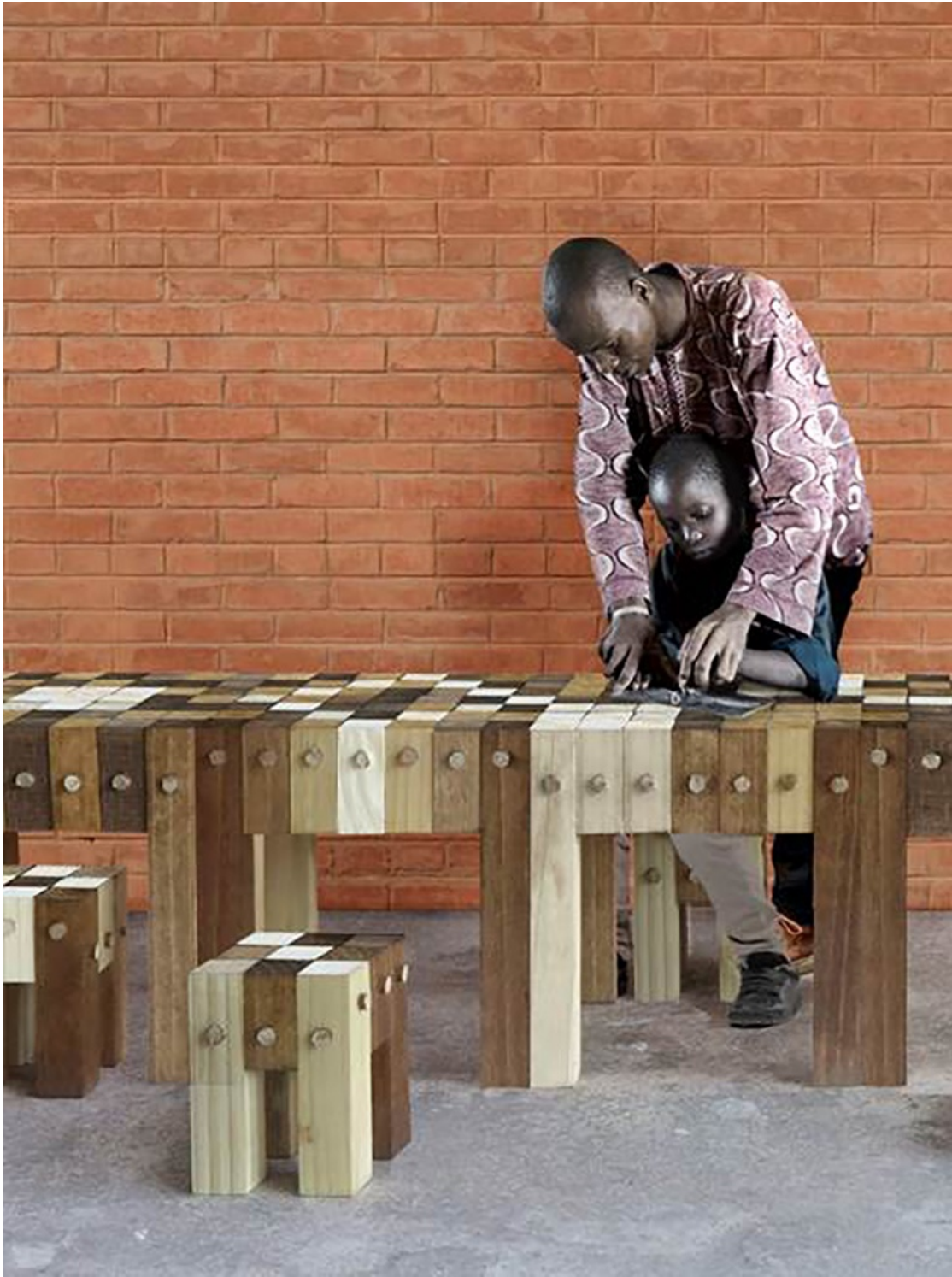
Mwabwindo Series furniture prototype in walnut, ash and cherry by Christ & Gantenbein for the Mwabwindo School in Zambia by 14+ Foundation , Selldorf Architects , and Rashid Johnson , joint winners of the 2017 Panerai Design Miami/ Visionary Award , being displayed at the entry to DesignMiami .