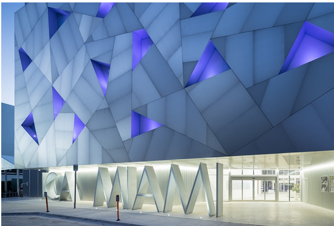
The new Institute of Contemporary Art Miami by Aranguren + Gallegos Arquitectos , the first U.S. project by the Madrid-based firm.