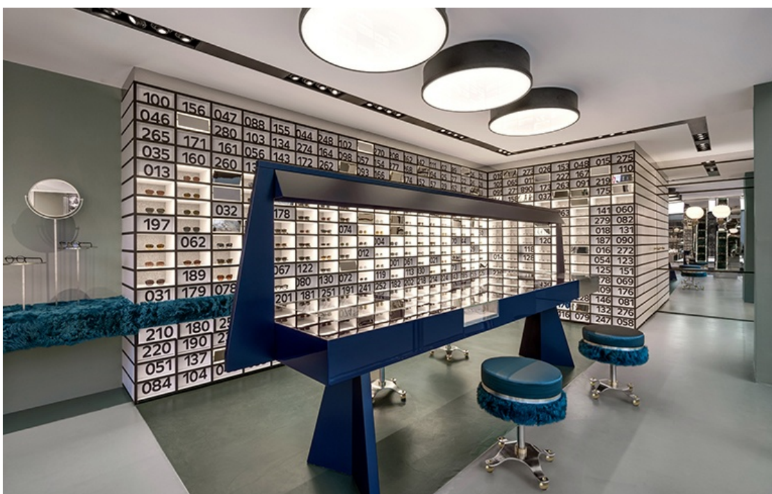
The just-opened Oliver Peoples boutique in the Miami Design District by DimoreStudio .