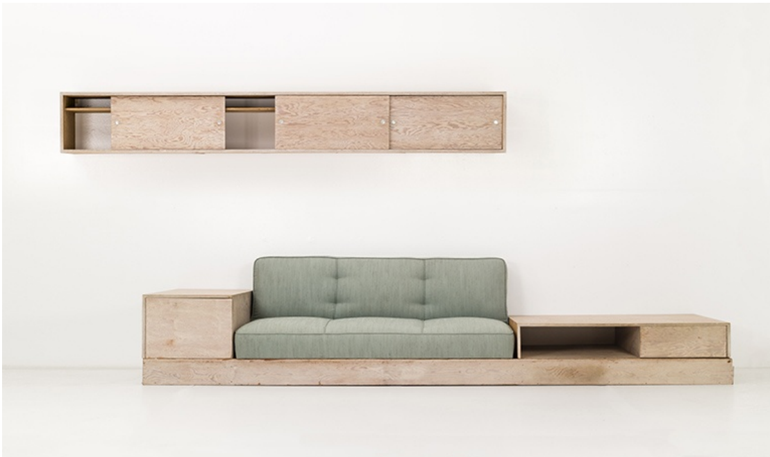
Suite of 1940's Albert Frey furniture salvaged from Frey House 1, through Converso gallery, first time exhibiting at DesignMiami .