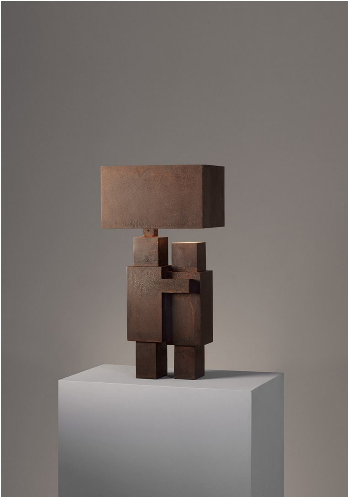
The Kiss lamp in Cor-Ten steel by Atelier Van Lieshout , through Carpenters Workshop Gallery , first time exhibiting at DesignMiami .