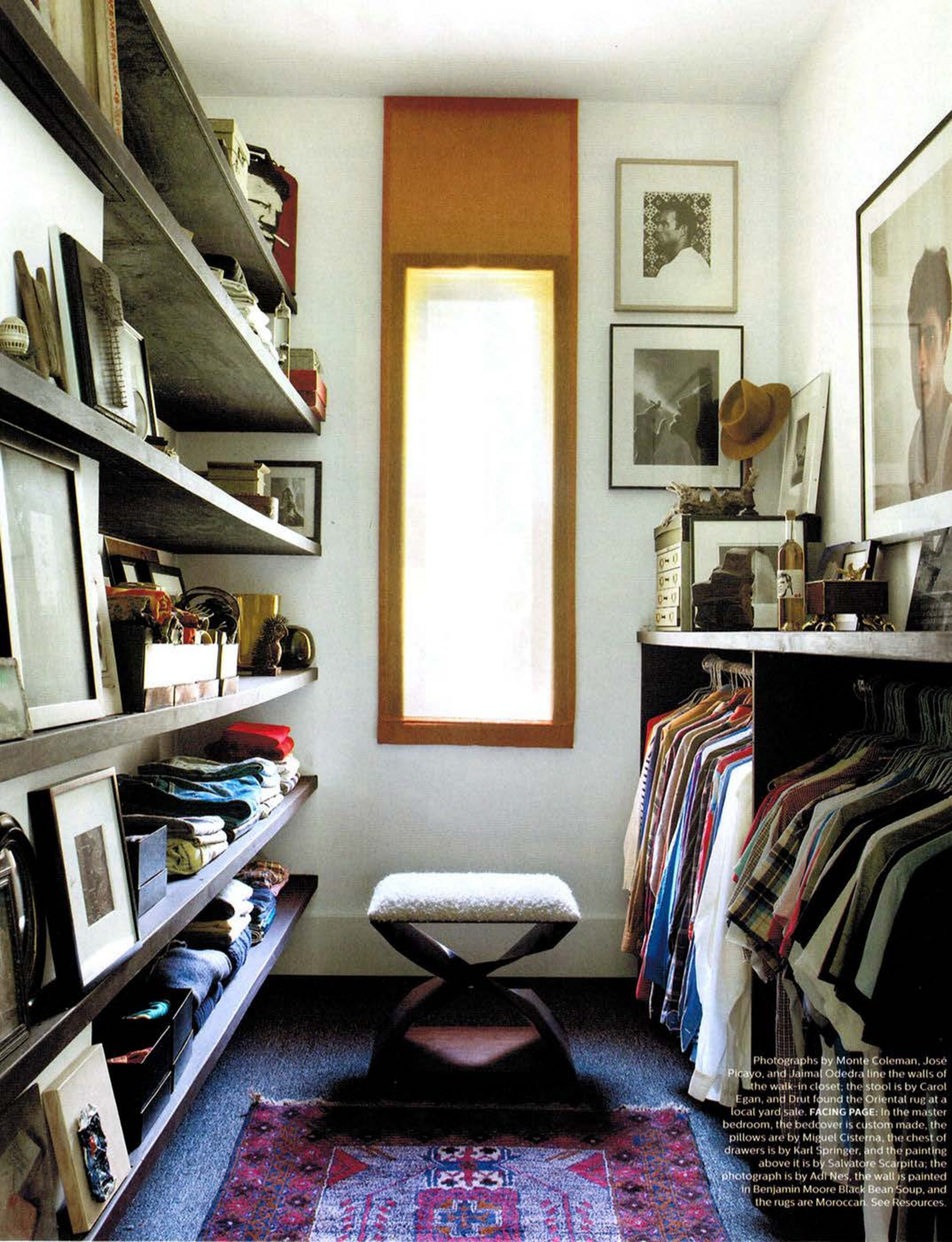
Photographs by Monte Coleman, José Picayo, and Jaimal Odedra line the walls of the walk-in closet; the stool is by Carol Egan, and Drut found the Oriental rug at a local yard sale. FACING PAGE: In the master bedroom, the bedcover is custom made, the pillows are by Miguel Cisterna, the chest of drawers is by Karl Springer, and the painting above it is by Salvatore Scarpitta; the photograph is by Adi Nes, the wall is painted in Benjamin Moore Black Bean Soup, and the rugs are Moroccan. See Resources.