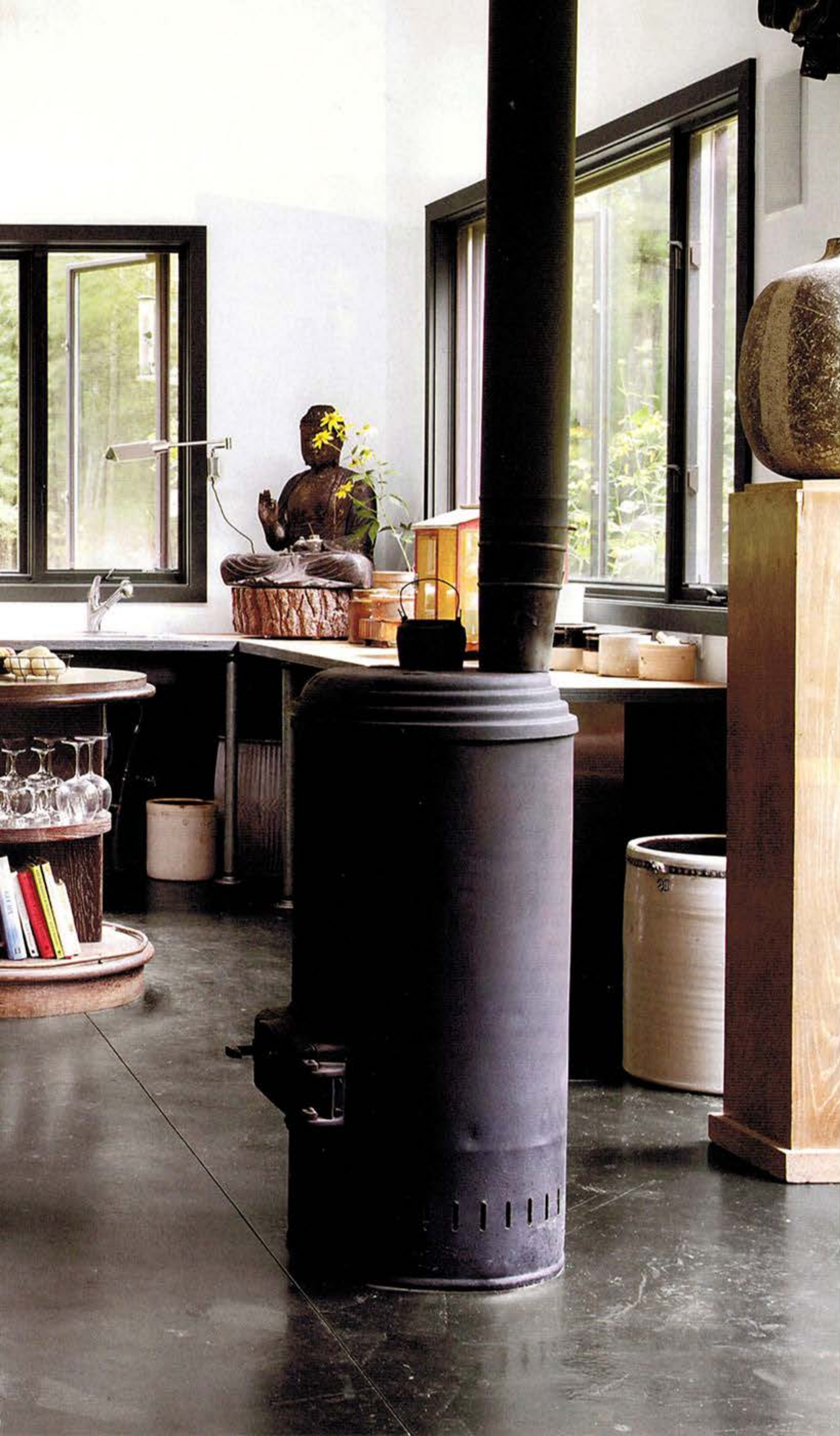
Drut bought the kitchen's vintage cast-iron woodstove from a local garage, and the circa-1800 side chair came from the South of France; the vintage limed-oak island originally served as a cutting table for a Lyon textiles firm, the pendant lights are mid-20th-century French, and the shovel sculpture is by Cal Lane. See Resources.