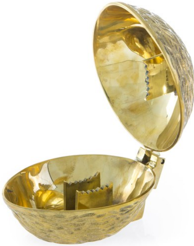
Noix nutcracker by Officine IADR for Seletti ; $335. seletti.it