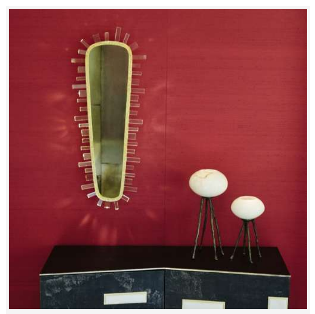
The Valentine Magnum mirror that Salvagni designed for Achille Salvagni Atelier.