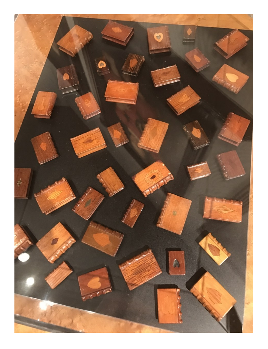
A collection of 41 tiny book-shaped whimsies.

A collection of 41 tiny book-shaped whimsies, made in America in the mid- to late 19th century. e largest measures only 1.5 inches by 1 3/16 inches by 3/8 inches.