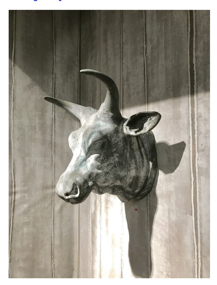
An English butcher's trade sign.