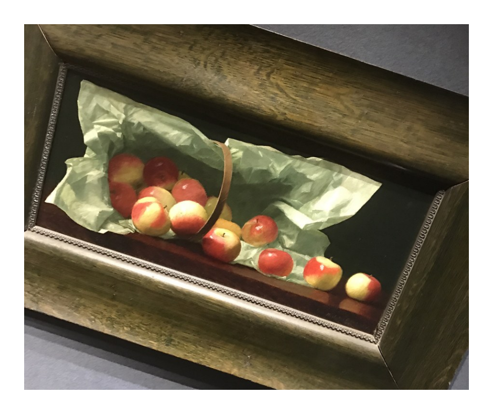
Apples in a Basket.