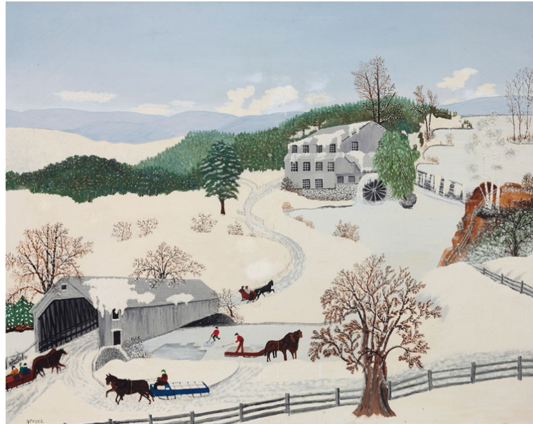
Grandma Moses, The Old Covered Bridge , 1943. At Olde Hope Antiques