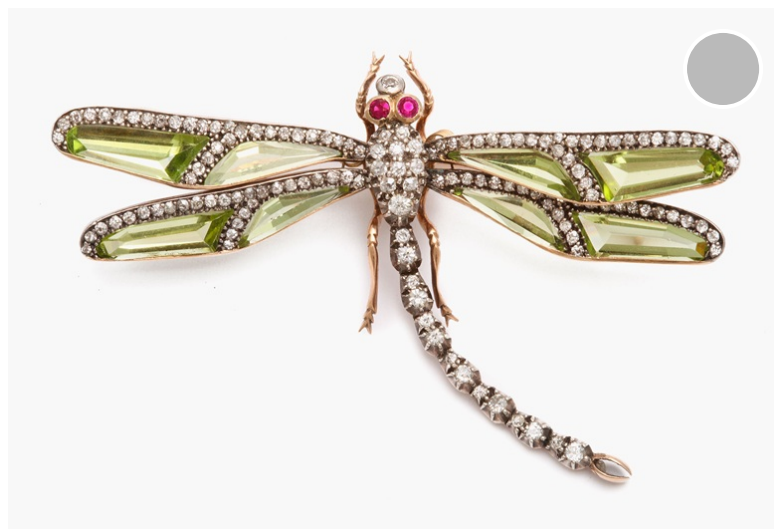
Pin in the form of a dragonfly featuring diamond body with peridot and diamond wings, en tremblant , set in silver and gold, at A La Vieille Russie