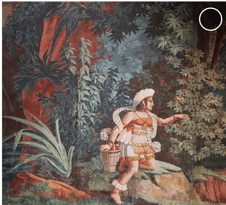
Inca Dufour wallpaper at Thibaut