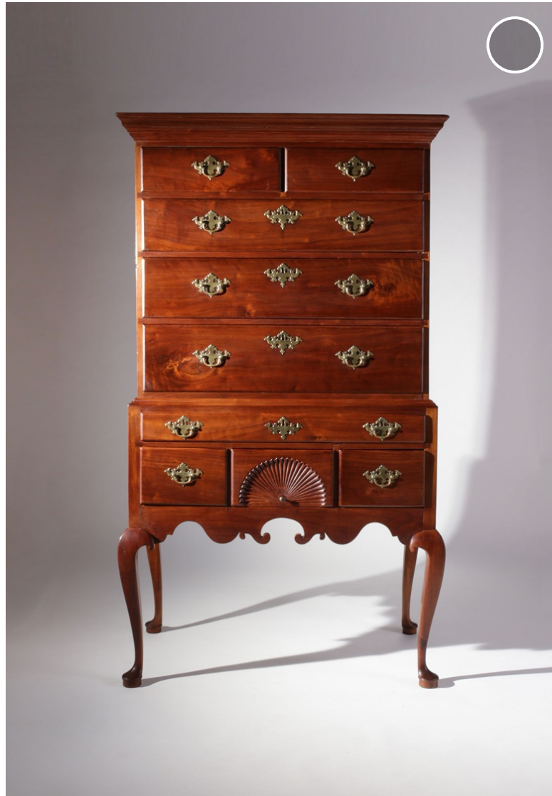
Queen Anne walnut flat-top highboy with a deeply scrolled apron, circa 1750, from the North Shore of Massachusetts, possibly Salem, at Nathan Liverant and Son