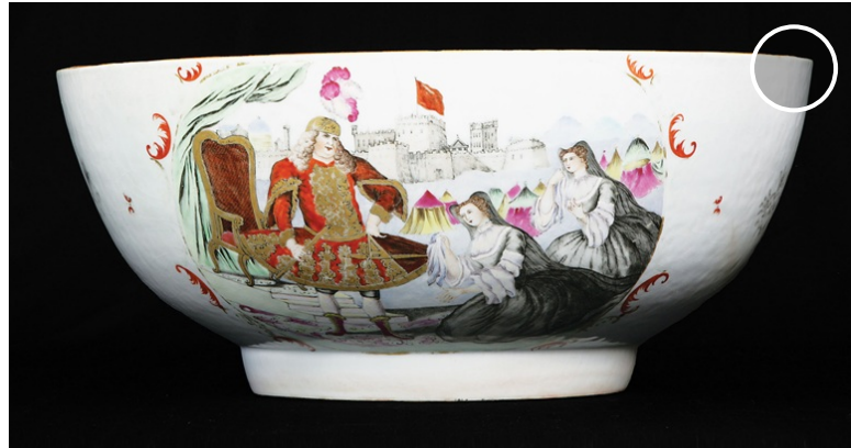
Porcelain Chinese export punch bowl with European figures inspired by a theatrical print of 1749 depicting an actor playing ‘Coriolanus’ on stage at Covent Garden, at Cohen & Cohen