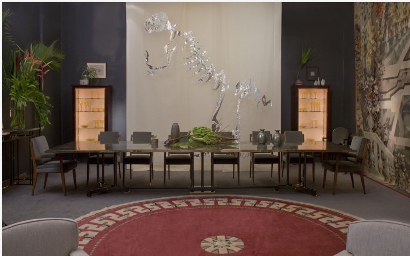
The Maison Gerard Gallery

The East Village, my neighborhood for 23 years. It's a charming and authentic community with an intimate feel within the big city.