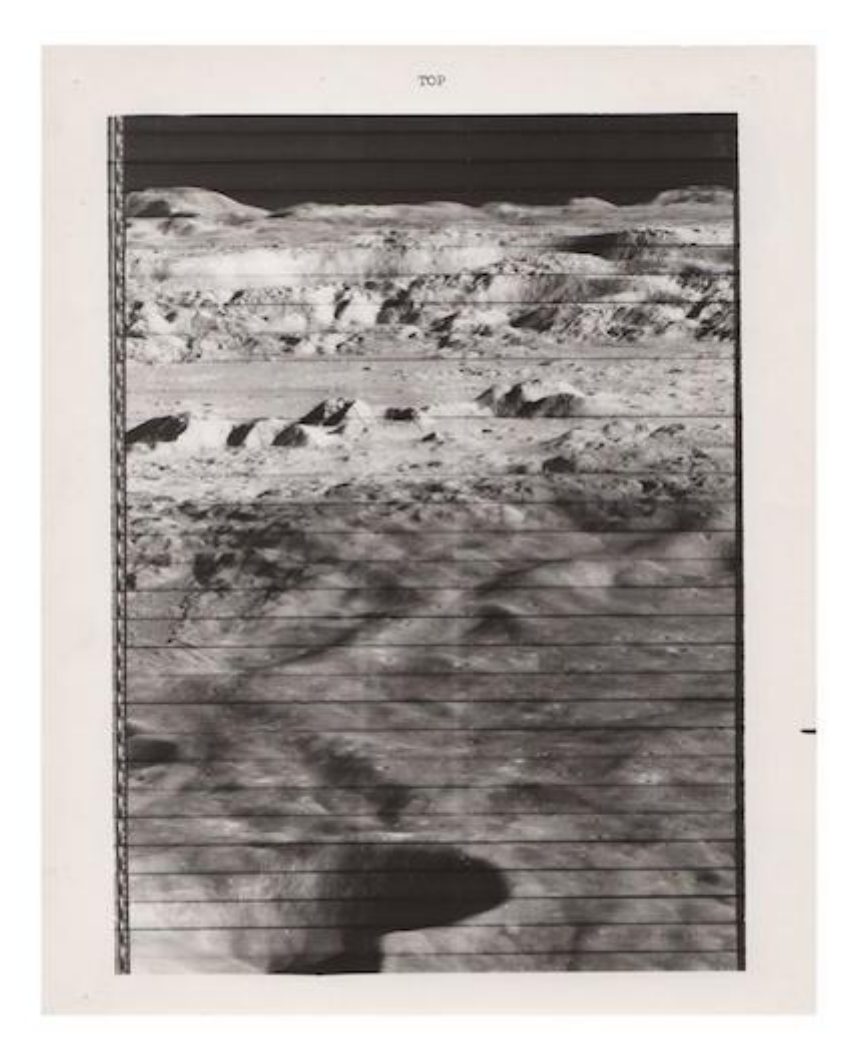
Lunar orbiter vintage gelatin-silver print by NASA, 1966, offered by Jason Jacques

The richness of the gelatin-silver process lends itself to bare walls. This view of the crater Copernicus was transmitted in November of 1966. The piece offers further proof that monochrome does not equal boring — and it won't compete with colorful furniture.