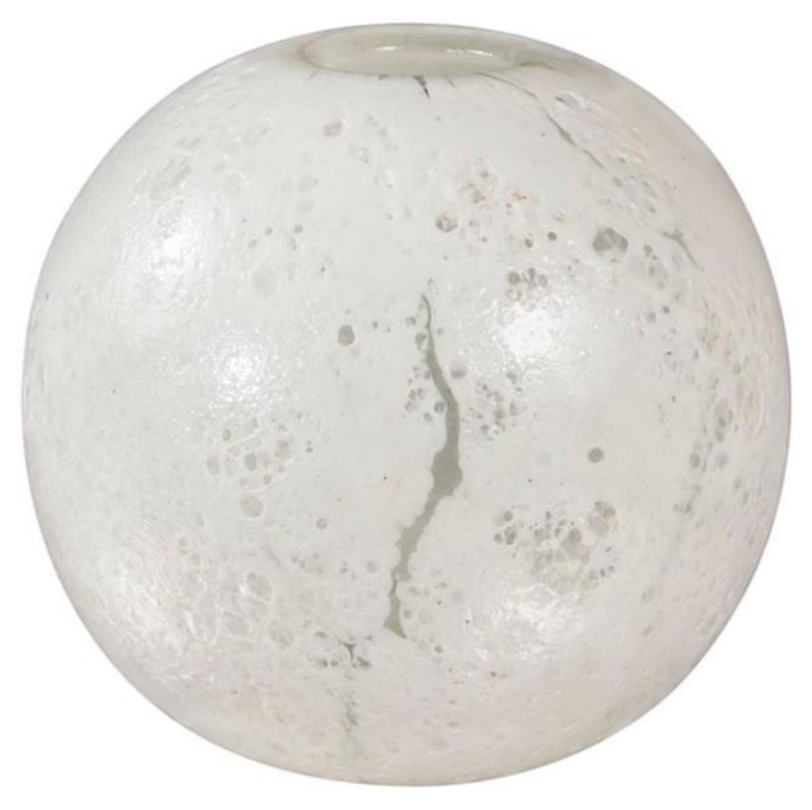
Franco Deboni's handblown-glass vase, 2012

Venetian glass master Franco Deboni brings sky and soil together with this perfectly imperfect vase. Whether filled with a dozen lush roses or muted hydrangeas, it's the astronomical equivalent to wabisabi. Who says nothing grows on the moon?