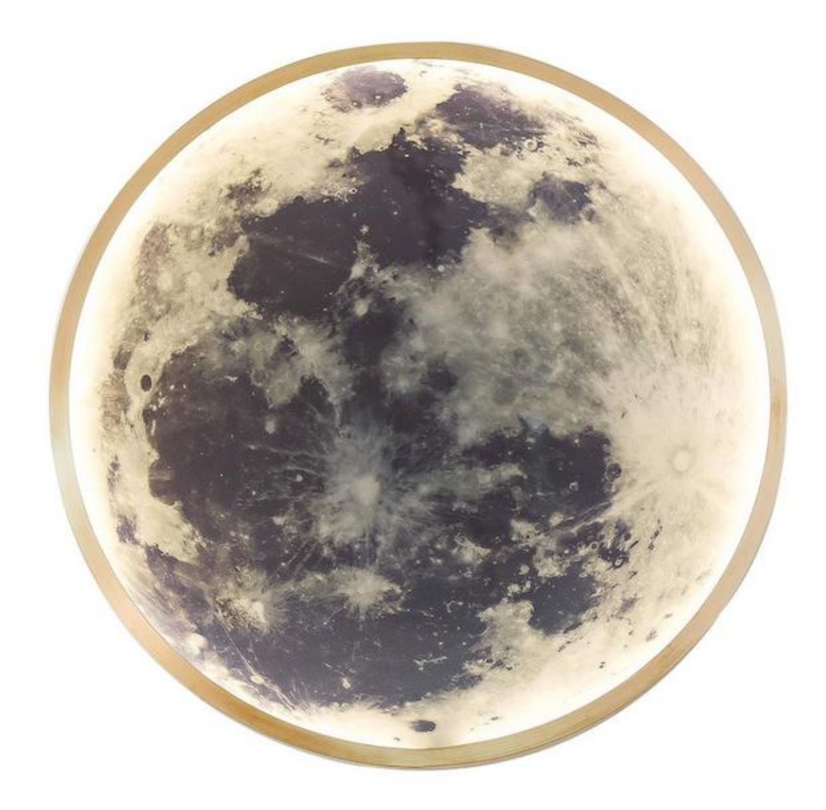
Ben and Aja Blanc's wall-mounted Moon light, 2010-

RISD sweethearts-turned-collaborators Ben and Aja Blanc produce a host of celestial designs from their home in Providence, Rhode Island. This brushed-bronze and glass light emits a soft glow and doubles as a sculpture. In the tradition of Light and Space artist Lita Albuquerque, it takes the form of a flat circle.