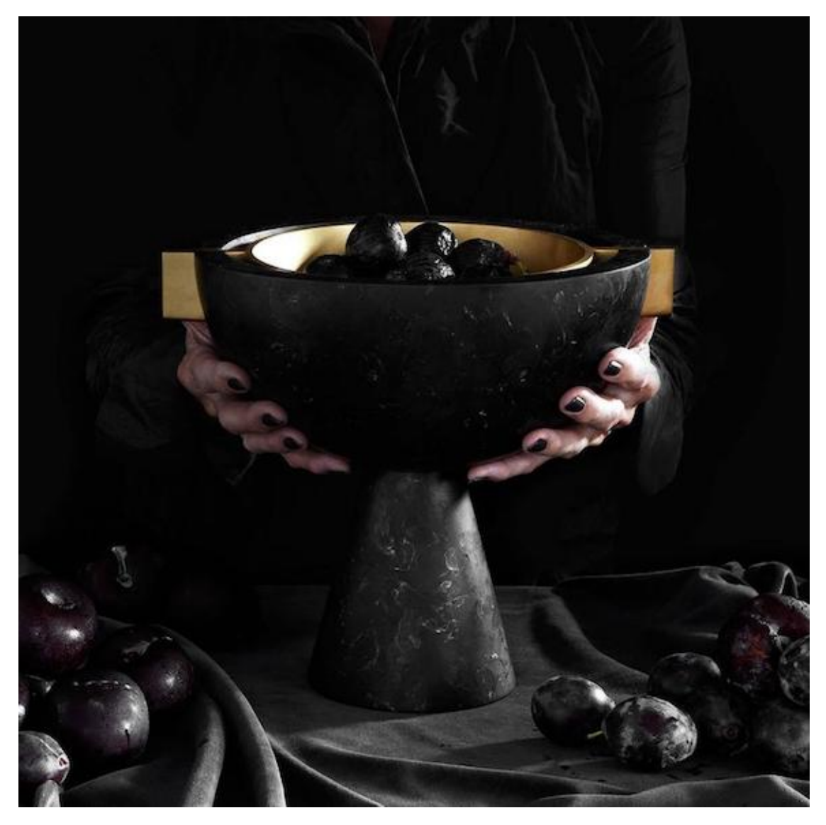
Apparatus's Neo vessel, made to order

Lest you think the West Coast has a monopoly on all things New Age-y, the designers behind Apparatus have built a cult following from New York. The duo's mesmerizing brass and marble Neo vessel looks like a Pensieve for all your dark thoughts.