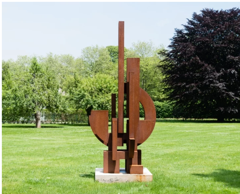
Marino di Teana, Liberté , Monumental Sculpture (1988/2013).