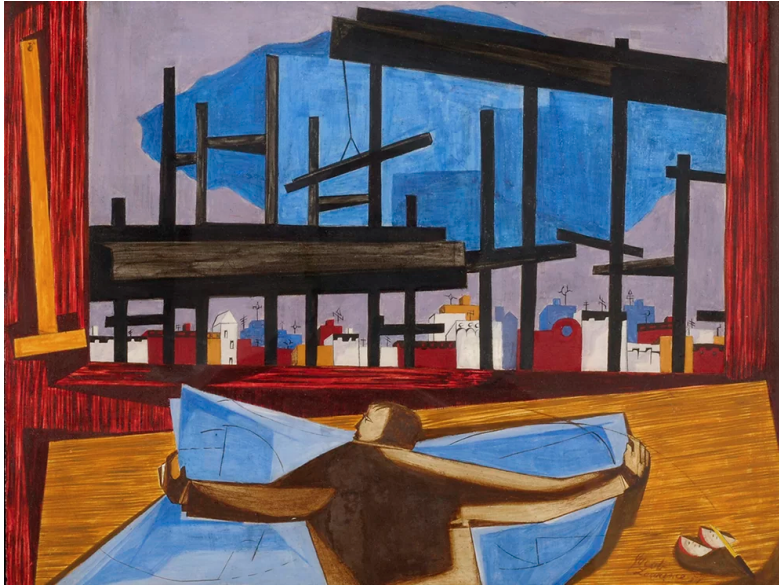
Jacob Lawrence, The Architect (1959).