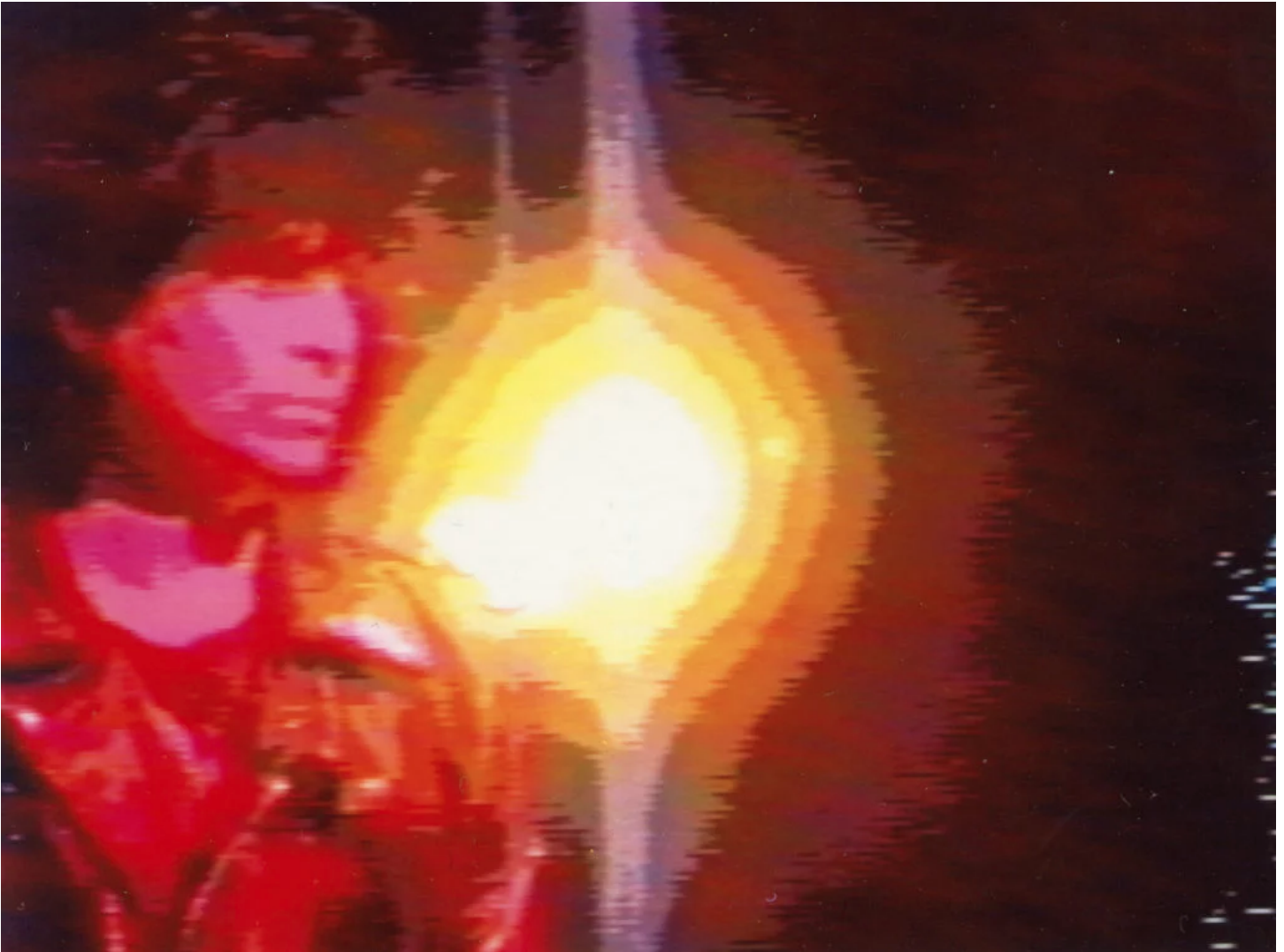
Alan Vega

A year after the passing of Alan Vega, a.k.a. Alan Suicide, Deitch Projects presents “Dream Baby Dream,” a memorial exhibition in honor of Vega’s life and body of work as a musician and visual artist. Vega, who is best known for being part of the seminal electronic punk duo Suicide, is considered a harbinger of the punk movement in the ’70s. The exhibition will feature videos documenting performances by Suicide, as well as Vega’s sculptures and works on paper.