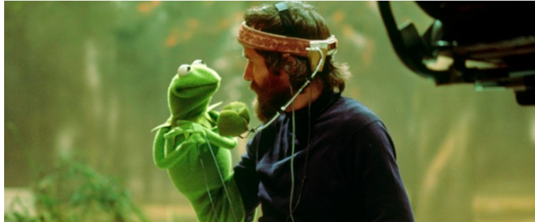
Jim Henson and Kermit the Frog on the set of The Muppet Movie.

At long last, the Museum of the Moving Image (MoMI) is unveiling its permanent tribute to Muppet creator Jim Henson (1936–1990), based on over 500 objects from his archives donated by his family. Among them will be 47 historic puppets for such beloved characters as Big Bird, Elmo, Kermit, Piggy, and the Swedish Chef, as well as characters from the TV show Fraggle Rock and the 1982 film The Dark Crystal . The exhibition, funded in part by a successful Kickstarter ( https://www.kickstarter.com/projects/899731242/the-jim-henson-exhibition-at-museum-of-the-moving ) campaign, has been four years in the making, and is the eagerly awaited sequel to MoMI’s 2011 “Jim Henson’s Fantastic World” exhibition.