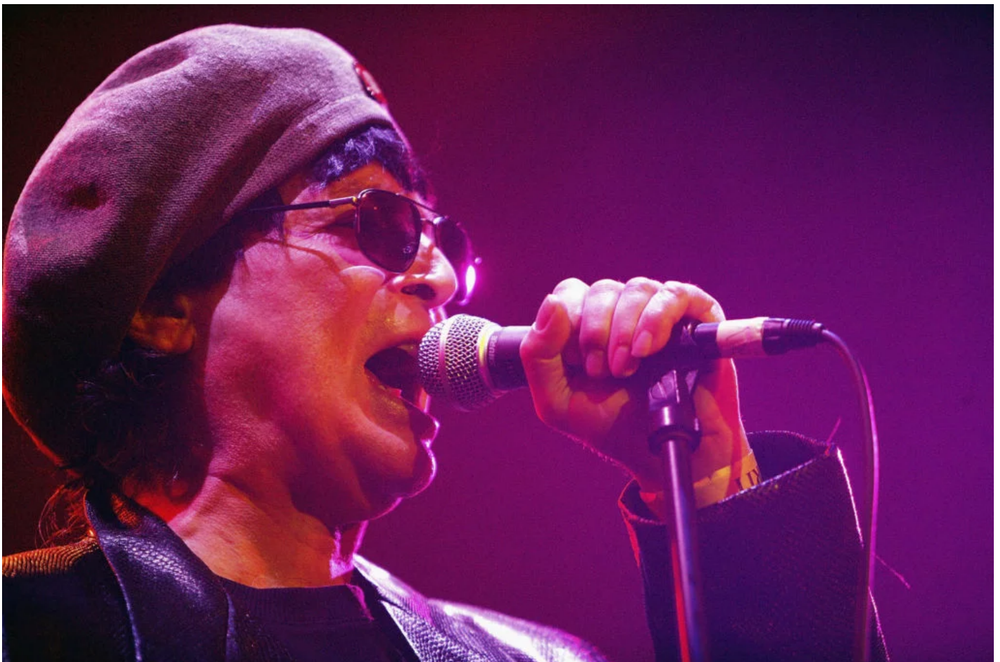
Alan Vega performs in 2004 in New York City.

Each week, we search New York City for the most exciting, and thought-provoking, shows, screenings, and events. See them below.