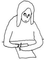
LIANA FINCK PASSING FOR HUMAN

1. WHAT WAS THE NAME OF YOUR FIRST LOVE'S FIRST LOVE?