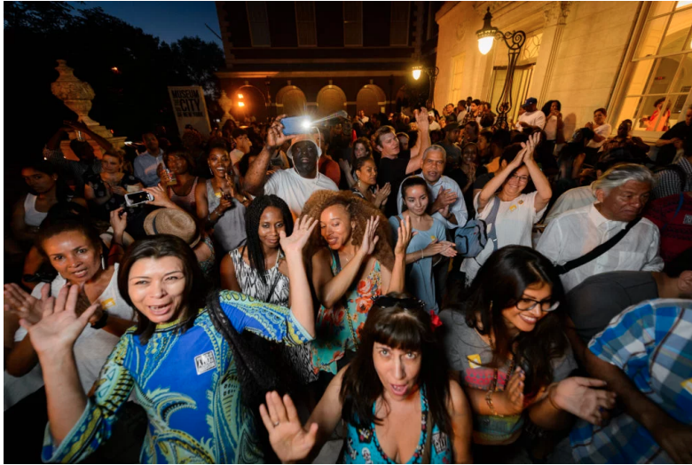
Uptown Bounce 2016 at the Museum of the City of New York.

Wednesdays, July 19, July 26, August 2, and August 9