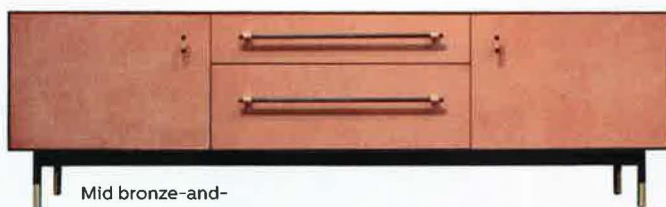
Mid bronze-and-leather credenza by BDDW.