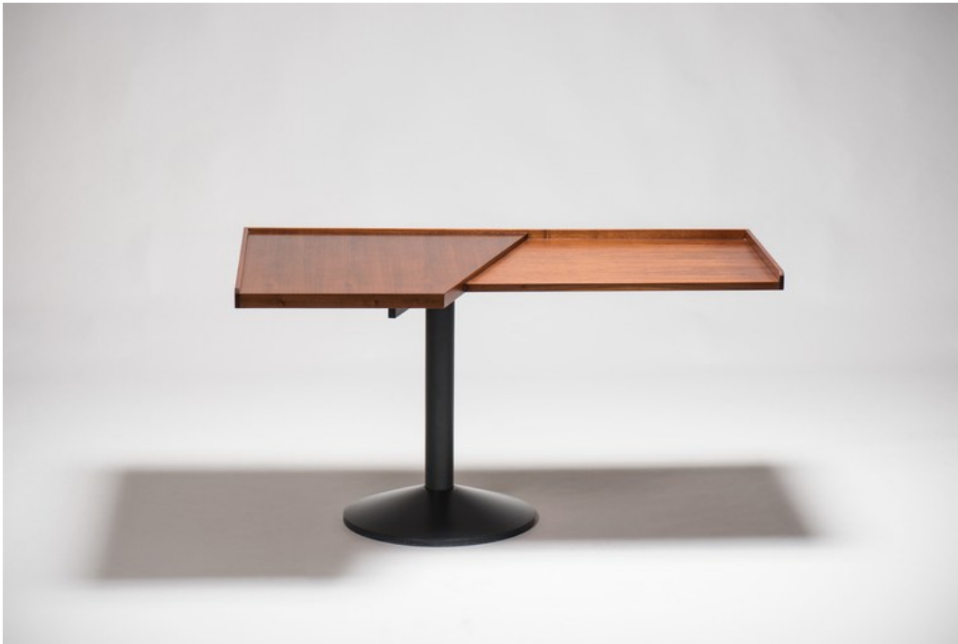
The Stadera desk by Franco Albini.