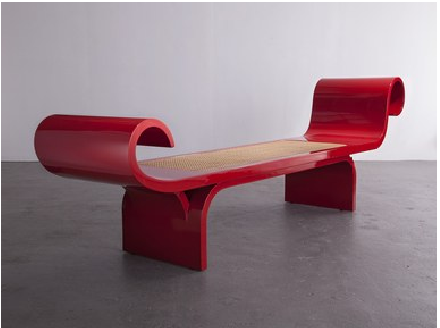
An Oscar Niemeyer bench on display at Expo Chicago.