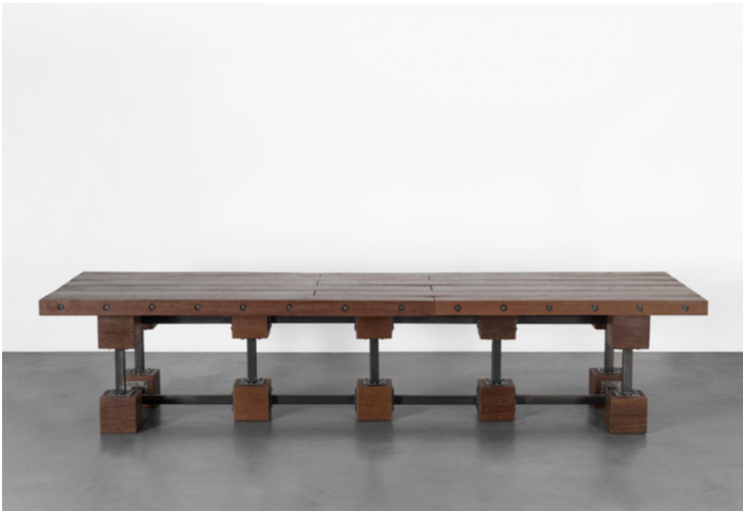
Atelier Van Lieshout's table, shown by Carpenters Workshop Gallery.