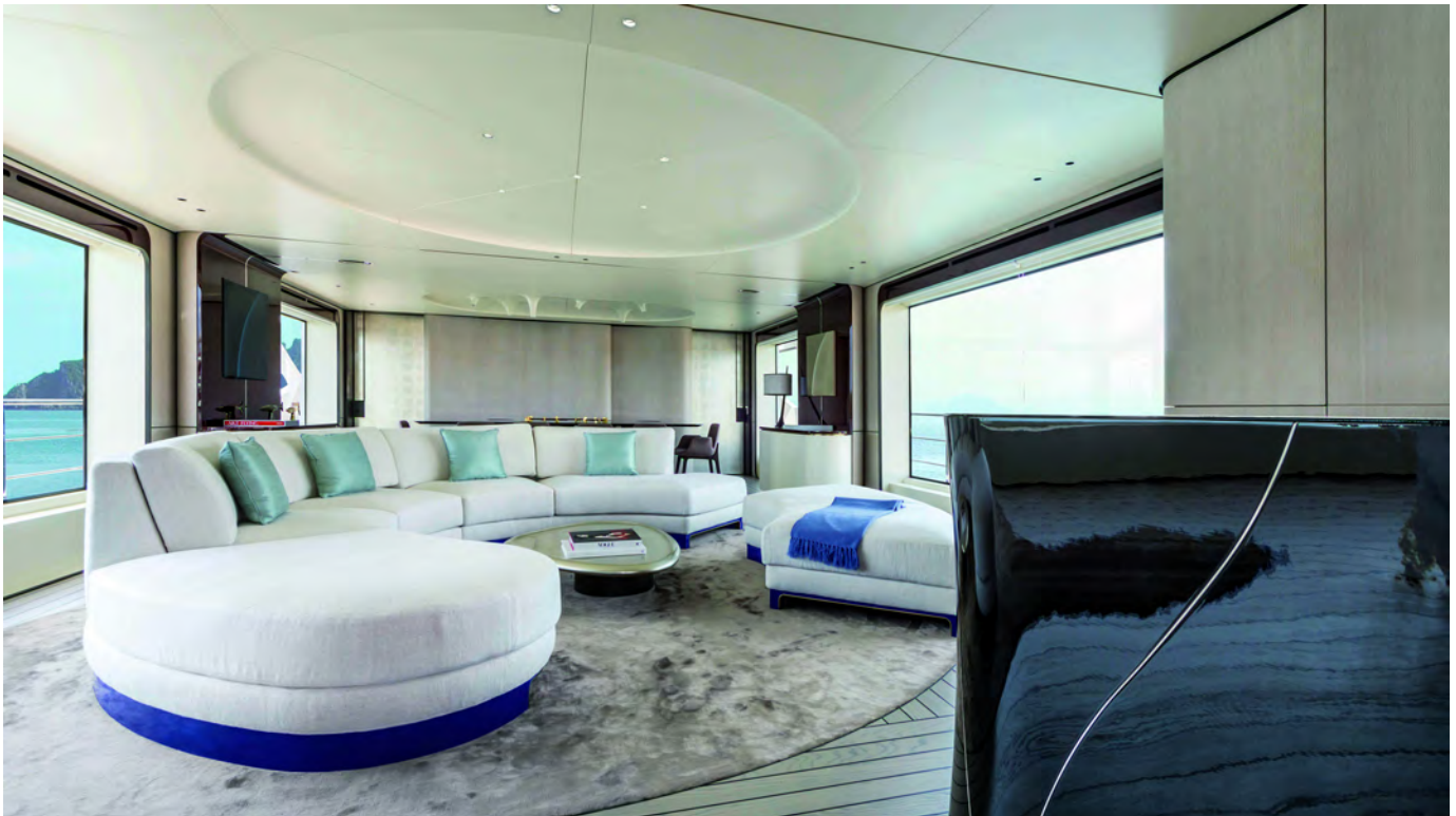
Main saloon.

Salvagni's architectural background has largely been in upscale residential projects, but he has designed many custom yachts, including two recent Rossinavi launches, Endeavour and Aurora. He employed a bespoke approach to designing the 35 Metri's interior, creating custom furniture, cabinets, and lamps as well as shaping the walls, ceilings, and other decor. In the saloon, a circular sofa sits on a circular rug. The overhead lights are molded into the ceilings, almost like natural appendages, while on a cabinet a large white oval sculpture looks like a beautifully shaped ear. "The cabinets on the right side of the saloon were like a branch of wood to me," says Salvagni. "It has a mahogany top with bronze pieces that look like they're growing organically from the wall."