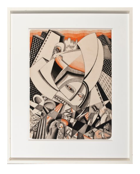
"City" (1921), by Winold Reiss, at the Bernard Goldberg

Fine Arts booth at the Salon Art + Design, at the Park Avenue Armory. The estate of the artist, 1953 until the present