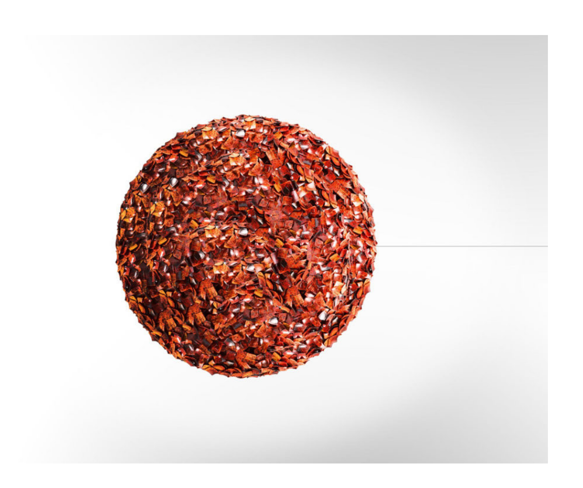
A light by Barnaby Barford.