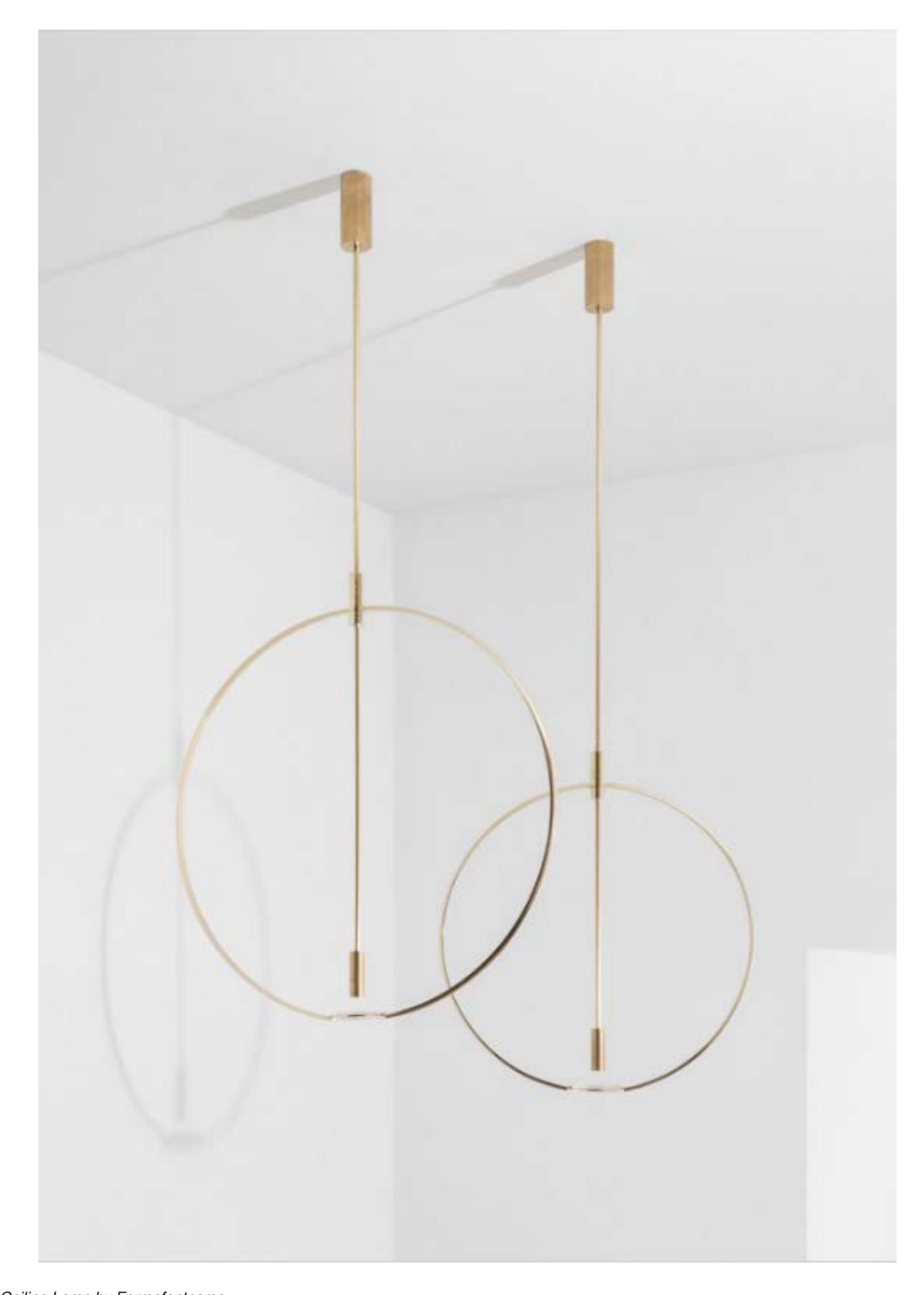
Magnifier Ceiling Lamp by Formafantasma.