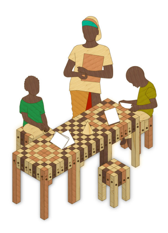
Christ & Gantenbein's furnishings for Zambia's Mwabwindo primary school.