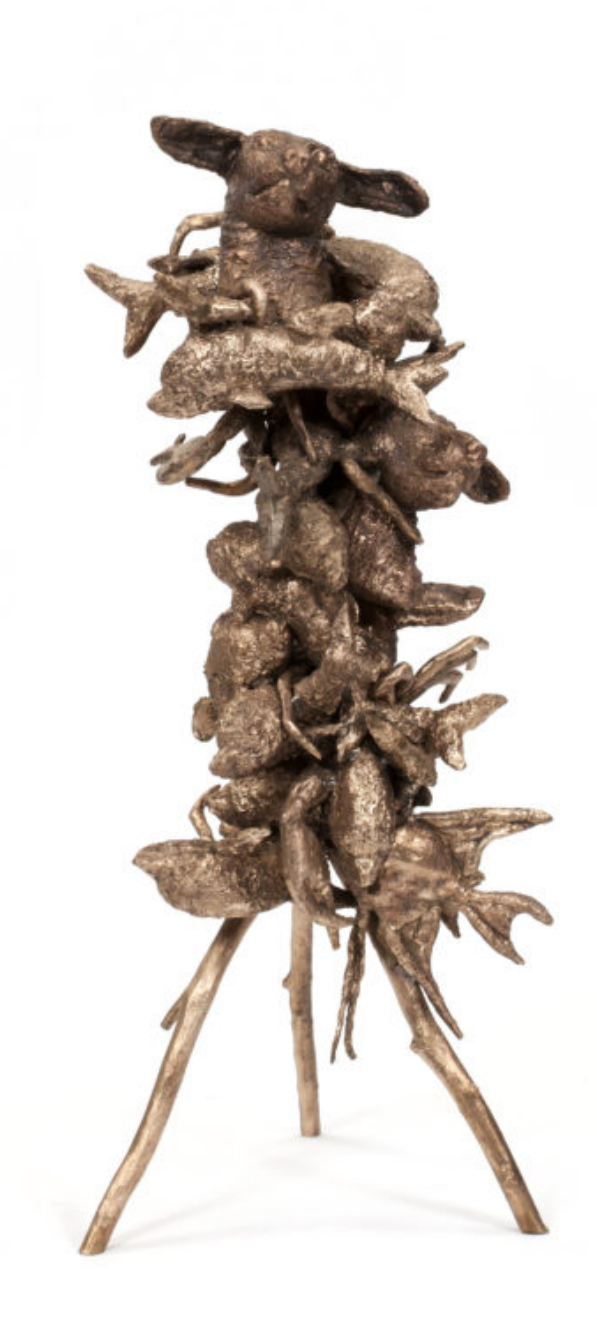
The Noah candlestick, in bronze, 2017.