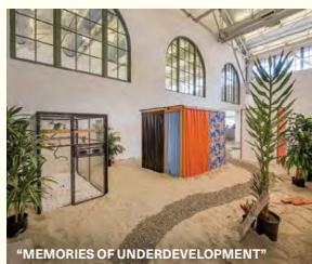
"MEMORIES OF UNDERDEVELOPMENT"