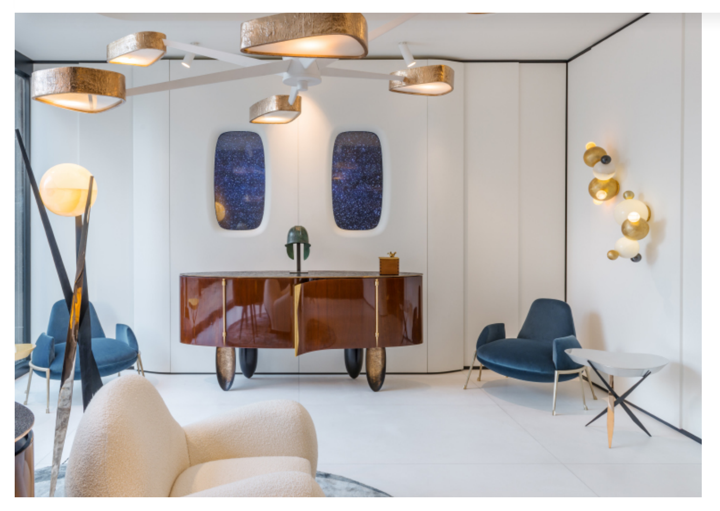
The Spider chandelier presides over the first room, which features two portholes backdropping a European walnut Silk cabinet flanked by Papillia armchairs.

Inside, portholes punctuate white-paneled walls, adding new dimension to Salvagni's classic furnishings. The six-armed Spider chandelier, in white patinated cast bronze and backlit onyx, presides over the gem-like Emerald and Menhir side tables. These display alongside Bubbles sconces, a Pietra coffee table, and Papillia armchairs, all brand-new. Astronomic references pervade each: the Cosmedin side table's surface recalls the marbled appearance of planets from afar, and Papillia resembles extraterrestrials. "I wanted to imagine a futuristic yet opulent interior with highly crafted pieces and design a personal response to the imminent exploration of this uncharted territory, another marvel soon to be revealed," says Salvagni.