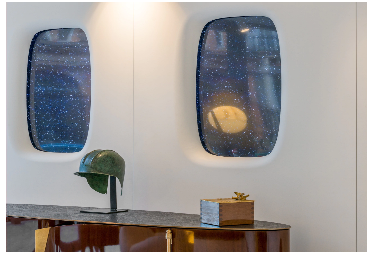
Paneled walls feature portholes seemingly looking out to space

What a vessel. In Salvagni's sumptuous retro-futuristic space capsule, inspired by set designs from iconic 1960s science fiction films, Stanley Kubrick's seminal <u>2001: A Space Odyssey (https://www.telegraph.co.uk/culture/photography/10755329/Behind-the-scenes-of-2001-A-Space-Odyssey.html</u>) has landed in Grafton Street. With three new pieces as well as a fine selection of works from the designer's classic collection, the playful exhibit shows that far from being kitsch, a little lightheartedness can go a long way.