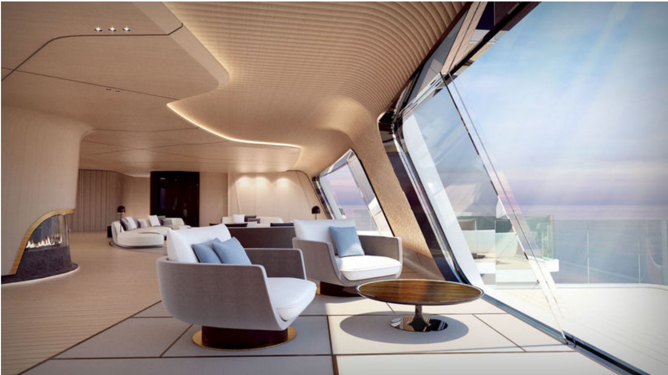
Tuhura is certainly an eye-catching, unique design. When presenting fairly radical concepts, what kind of feedback do you receive from owners and industry professionals alike?

It all depends on the individual as to how radical a particular project is perceived, everyone has a different concept as to what is radical and what is not. I don't see Tuhura as a radical concept at all. Radically beautiful – yes. This project can be built and will work well.