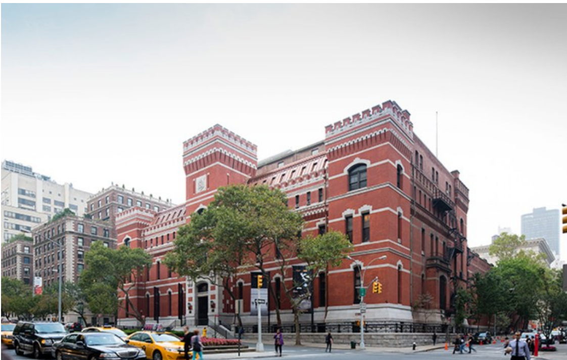
The Park Avenue Armory, host of the Salon Art + Design.