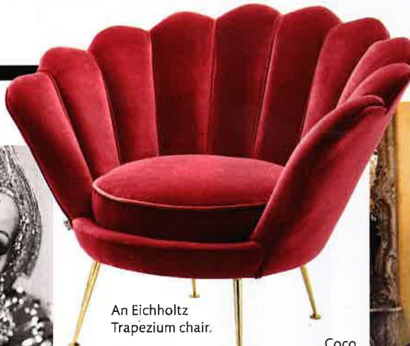
An Eichholtz Trapezium chair.