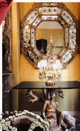
Coco Chanel's Paris flat.