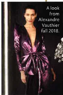
A look from Alexandre Vauthier fall 2018.