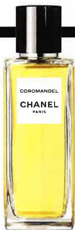
Chanel Coromandel perfume.