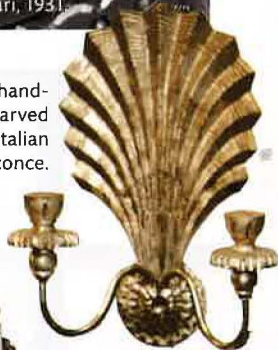
A hand-carved Italian scone.