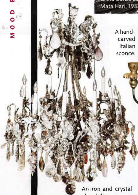
An iron-and-crystal chandelier.