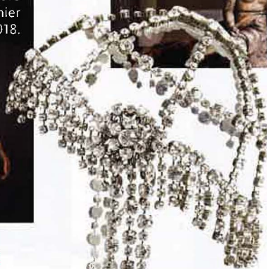
A Gucci fall 2018 headpiece.