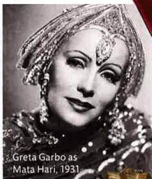
Greta Garbo as Mata Hari, 1931.