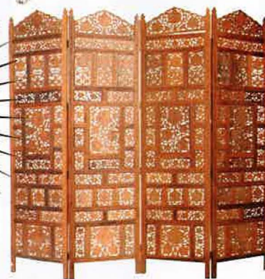
A carved Anglo-Indian screen.