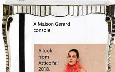
A look from Attico fall 2018.