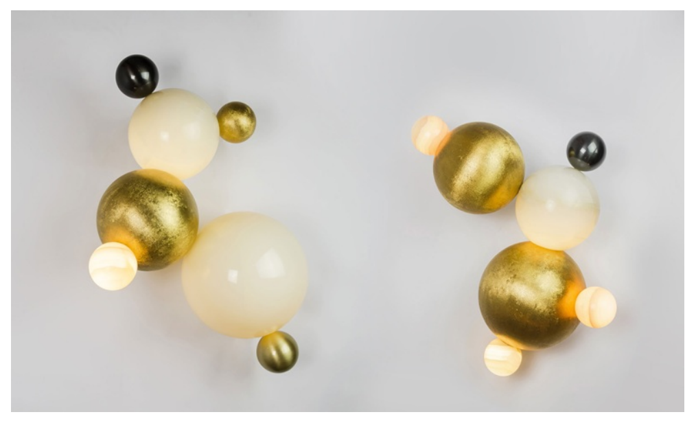
Achille Salvagni, Bubbles Wall Sconce B, 2018. Limited Edition of 20 pieces + AP. 24ct gold-plated bronze and backlit onyx wall sconce. Weight: 30Kg. Light source: 4 x bi-pin LED 1,5watt bulbs. Height: 19" (48cm) - Width: 12" (30cm) - Depth: 9" (23cm). Courtesy of Achille Salvagni

What new trends have you detected? 'This year we have a focus on jewellery with four new exhibitors and also a strong trend in sculptural design and collectible crafts.'