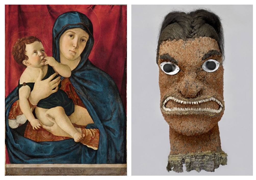
Giovanni Bellini, The Virgin and Child, circa 1475. Oil on poplar. 76 x 54.2 cm. Gemäldegalerie, Staatliche Museen zu Berlin