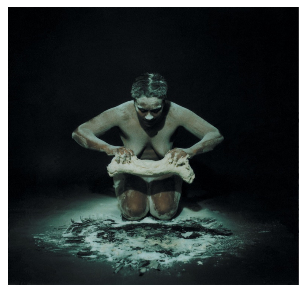
Berni Searle, Still, 2001. Digital prints on backlit paper, 8 images. 120 x 120cm each. Edition 3 + 1 AP © Berni Searle. Courtesy: of Stevenson, Cape Town and Johannesburg

What prompted the Social Work section at Frieze this year? 'In follow-up to last year's <u>Sex Work</u> project, <u>Social Work</u> convened a group of art historians, curators and writers. The outcome is a group of stands featuring women artists making important work in the 1980s and 1990s. Two further factors coincided with the project the anniversary of female suffrage and the <u>Freelands</u> <u>Foundation</u> report on the declining visibility of women in the arts.'