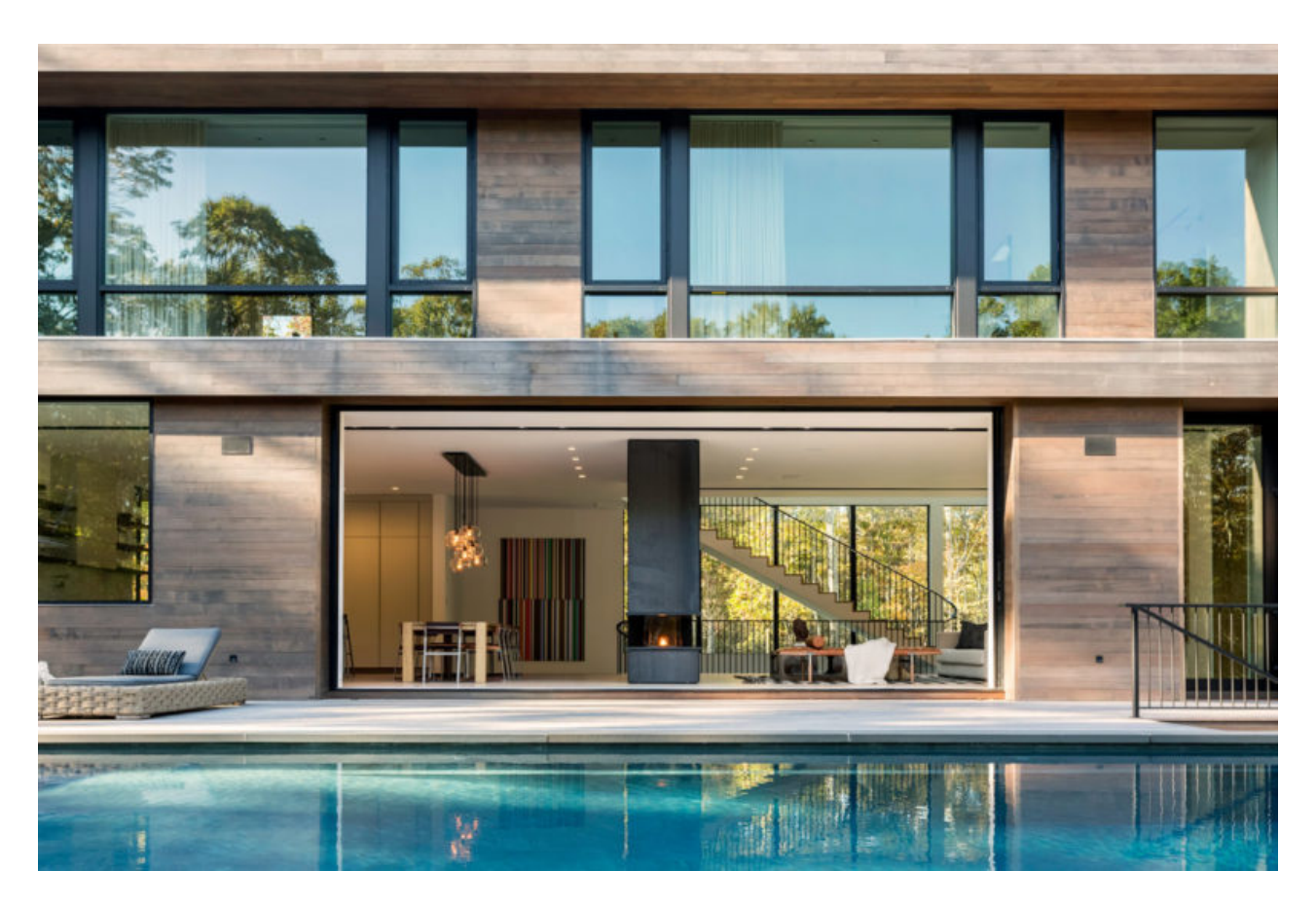
The opening spans 22.5 feet making the interior and exterior feel united.