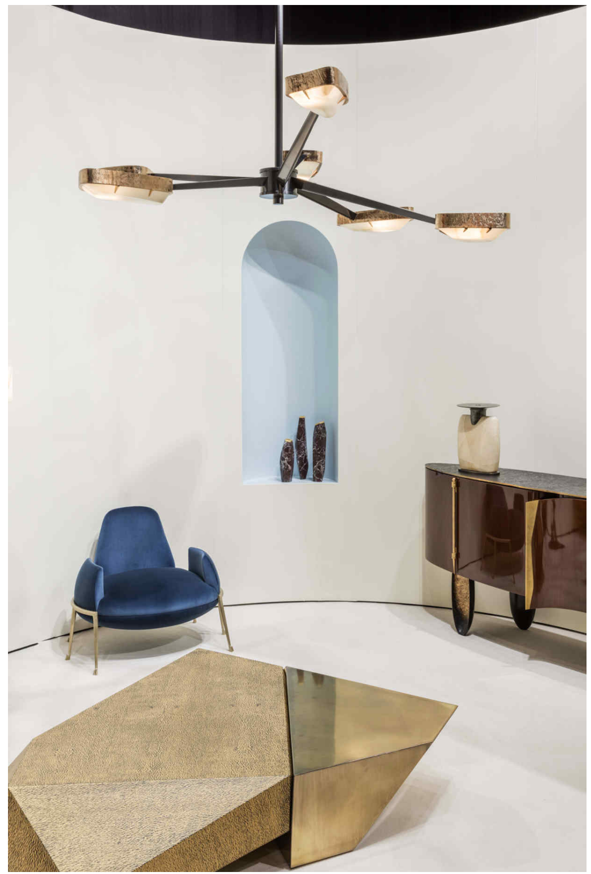
2015 Spider Jewel light in 24ct-gold-plated and burnished bronze and onyx, €93,600

Sculptural <u>lighting</u> is a Salvagni calling card, and a number of inventive creations are on display. Venezia (edition of 20, \in 26,400 ), a backlit, hand-carved, block-shaped onyx sconce recalls the beauty of a faded <u>Venetian</u> wall, yet incorporates the latest LED technology, while the Thor (edition of 10, \in 43,200 ) stands almost tip-toe-like on three burnished cast-bronze legs topped by onyx shades. The iconic Spider Jewel (2015, edition of 20, \in 93,600 ) in 24ct-gold-plated and