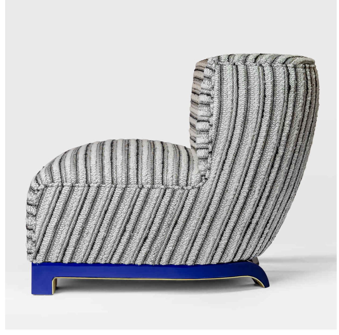
2013 Vittoria armchair, upholstered in velvet with lacquered wood and brass details, \in 26,400