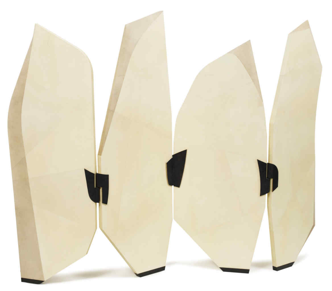
2016 parchment-lined Circeo screen with bronze hinges, €90,000

burnished bronze and onyx is also on view. But those visiting the show will, no doubt, have their imaginations drawn back to the sea – as the shape of the designer's parchment-lined Circeo screen (edition of three, \in 90,000) brings to mind the sails of yachts as seen from shore.