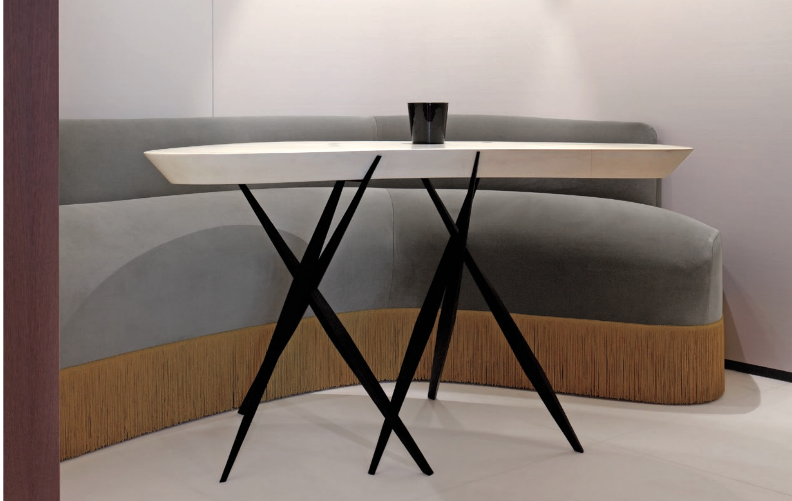
A limited edition Tango console made with a white parchment top contrasts with dark patinated bronze legs. See Resources.

CLOCKWISE ACROSS SPREAD FROM LEFT: JAMES MACDONALD (CONSOLE); ACHILLE SALVAGNI ATELIER (LAMP SHADE); NATIONAL PORTRAIT GALLERY, LONDON ("DITCHLEY PORTRAIT"); ACHILLE SALVAGNI ATELIER (ROMA CABINET); ISTITUZIONE CULTURALE MUSEO CIVICO DI SAN SEPOLCRO (FRESCO)