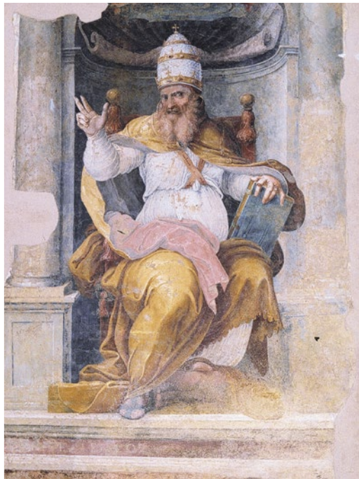
A fresco by Raffaellino del Colle (ABOVE) representing Saint Leo the Great from Oratorio di San Leo in Sansepolcro inspired the base of Salvagni's Roma cabinet (RIGHT). Each cast bronze leg is shaped like the Pope's tiara. See Resources.