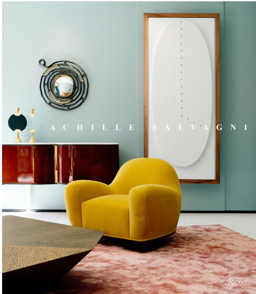
Achille Salvagni Courtesy of Rizzoli