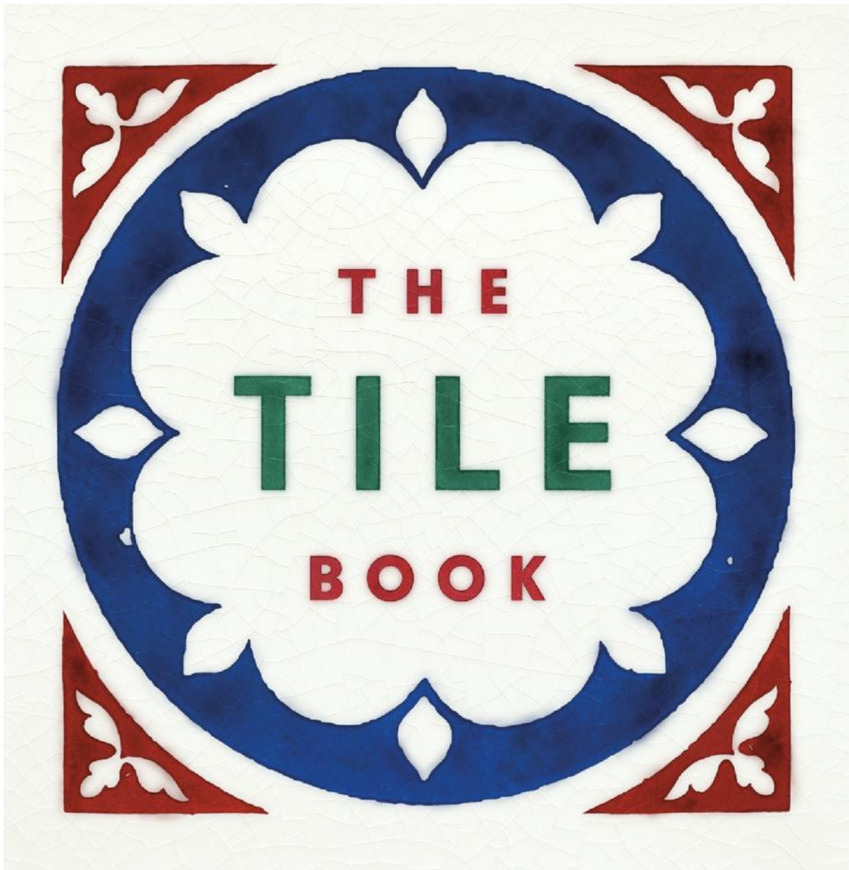
The Tile Book