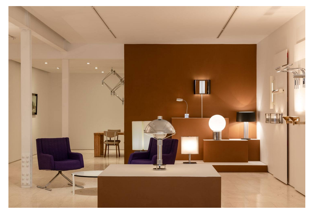
An installation view of the 50-plus lamps comprising "Verre Lumiere" at Demisch Danant.