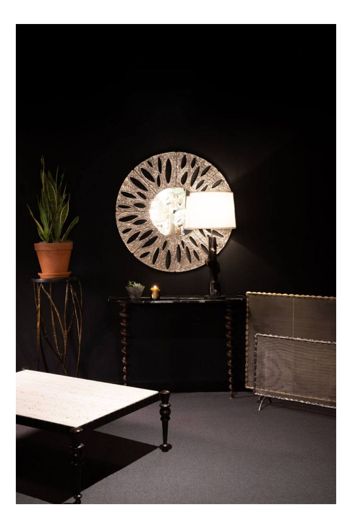
A selection of pieces by Franck Evennou on view at Bernd Goeckler.

But for those unable to travel or seeking inspiration that can be safely accessed in the New York area, an impressive lineup of shows promises the same thrilling mix of established and emerging designers from across categories and continents. Below, discover Galerie 's must-see exhibitions, many of which feature never-before-seen works, as well as an exciting new venue in Manhattan's Design District.