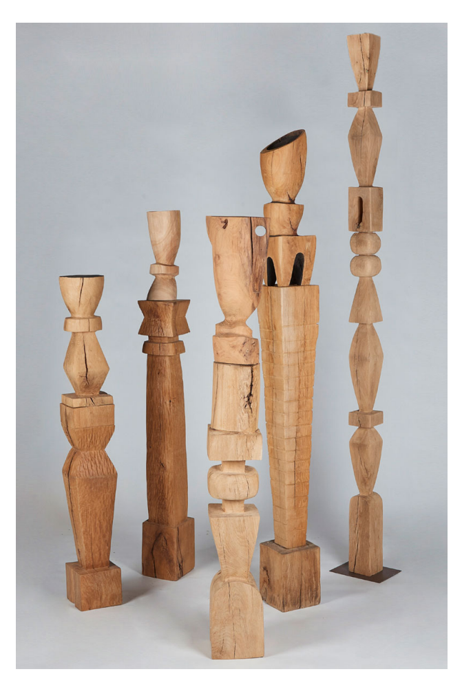
French artist Franck Evennou's creations are also on view at Maison Gerard.