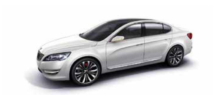
SPORTS & LUXURY CARS