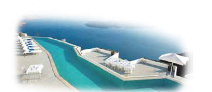
LIFESTYLE & TRAVEL