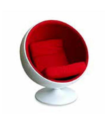
HOME & STYLE