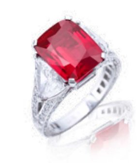
FASHION & JEWELLERY