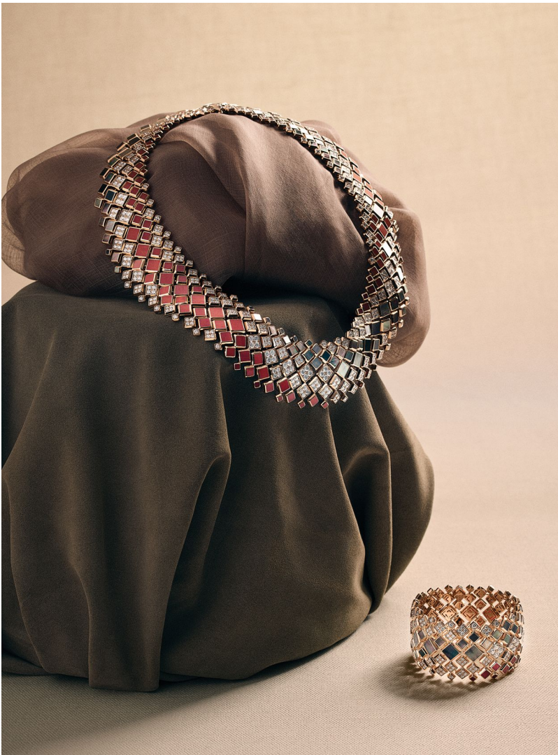
PHOTO: PHOTOGRAPHY BY MAXIME POIBLANC, FASHION EDITOR ALEXANDER FISHER, SET DESIGN BY CHLOE DALEY

A book on paleolithic cooking, a chic hotel in Boston and everything else we're obsessed with this month