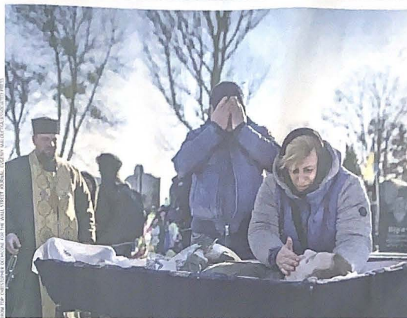
The mother and father of a 23-year-old Ukrainian soldier who was killed in fighting outside of Kyiv, Ukraine, on Thursday grieve at their son's funeral. Below, continued Russian attacks on Thursday laid waste to parts of the city of Mariupol.

◆ London's nickel market will stay closed at least until next week, giving the LME more time to resolve a crisis caused by a huge loss-making trade originating in China. B1