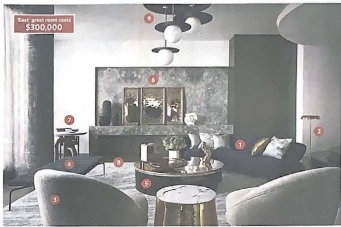
STYLING: LEE ANNUNZIO

R ich minimalism is the phrase used by Drake/Anderson, a New York City design firm, to describe the interiors of this sprawling apartment on a high floor in an iconic Tribeca tower in Manhattan. The owners, a couple with homes on both coasts, are repeat clients. They bought two 3-bedroom units from the building's pre-construction plans and combined them to create a 7,300-square-foot four-bedroom apt with its own gym and wine cellar. The resulting apartment has two great rooms, "east" and "west." The living area, shown here, is one of two seating groupings in the east great room. "We decided to really play up curvaceous and sensual forms as our choices for furnishings, and that also added a contrast to the very square and block-like structure and design of the building itself," said Drake/Anderson co-founder Jamie Drake. The strategy included emphasizing immovable forms, like the structural column on the left, which Mr. Drake had covered in a highly polished slightly metallic Venetian plaster. He also crafted an ebonized wood cabinet to hide a refrigerator and microwave. Design challenges, notes Mr. Drake, often become "real assets." This area of the room cost approximately $300,000 to furnish. Here are some of the design elements.