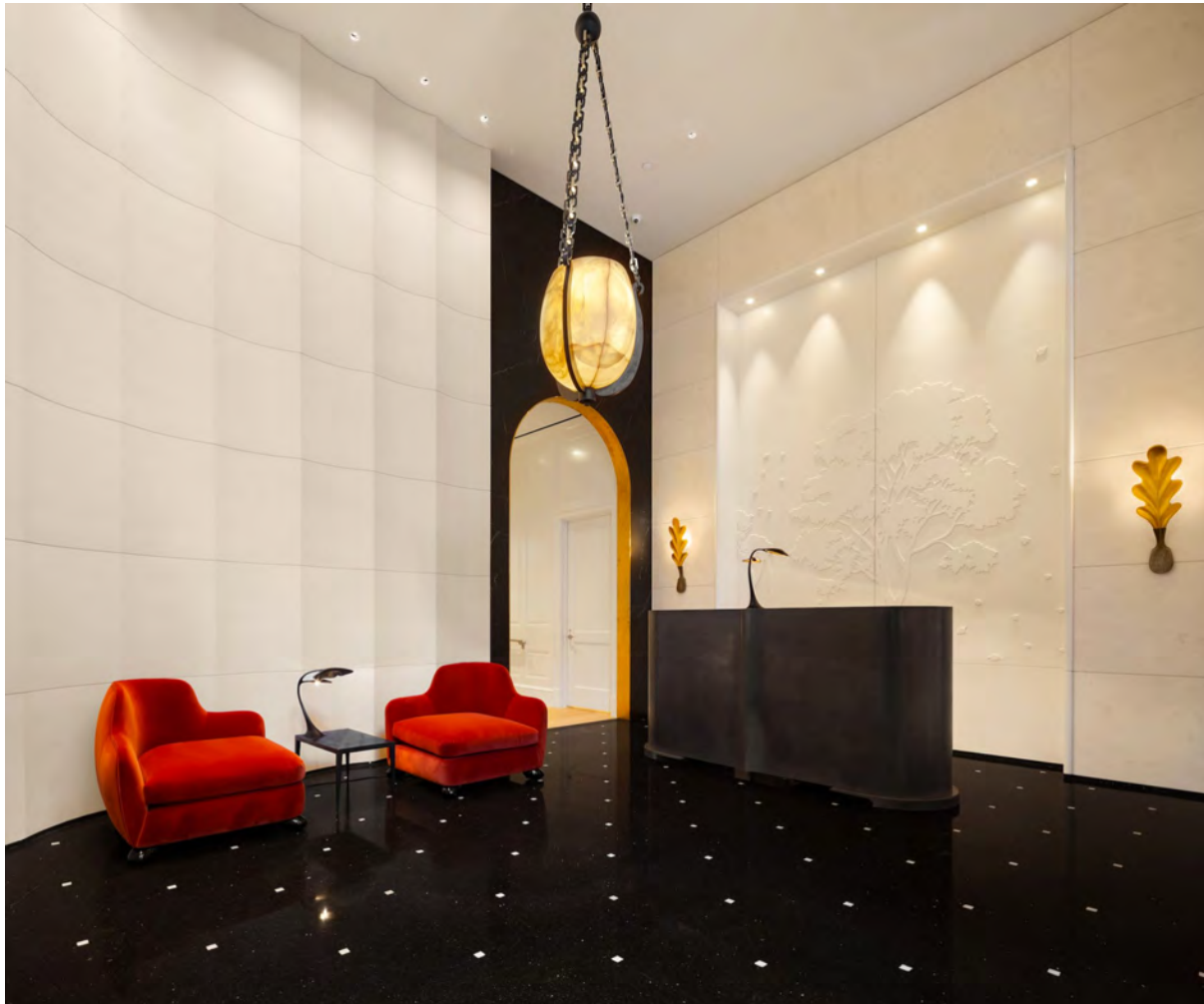
The lobby at the Bellemont in New York.