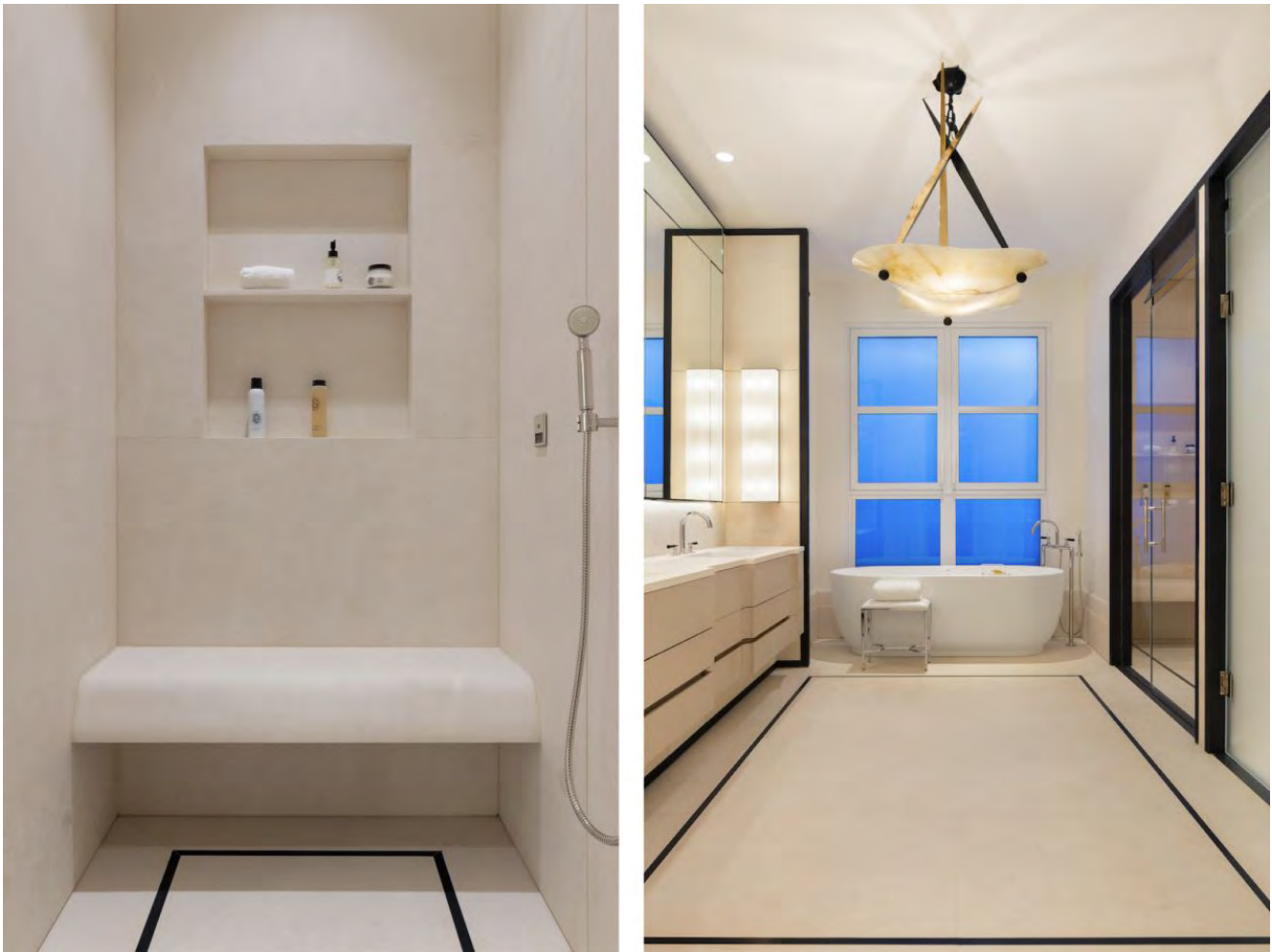
The primary bathroom inside one of the residences.

The lobby channels French orangeries and Central Park, with walls featuring a subtle bas relief depicting a treescape scene complemented by custom terrazzo floors with white marble leaf inlays. The reception desk, meanwhile, is a custom cast-bronze centerpiece facing a stone fireplace. Overhead hangs a grand, orb-shaped chandelier of onyx and bronze. The building offers incredible high ceilings with soft mouldings and decorations, allowing for great volume spaces which are quite extraordinary.